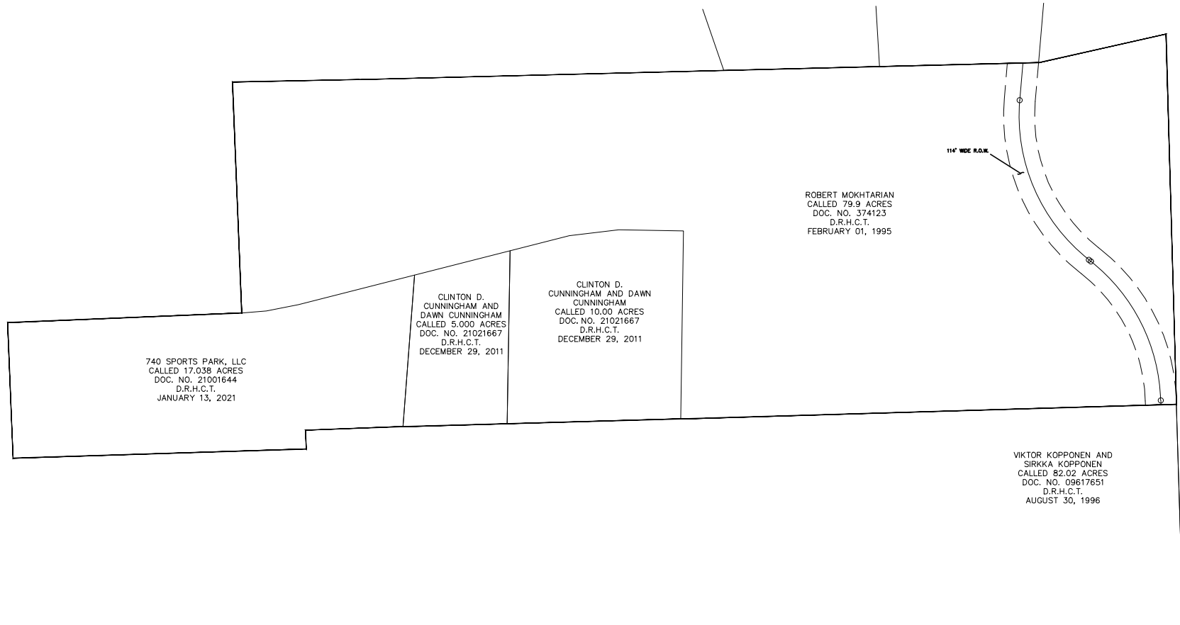
Exhibit E - Dedication of Easement