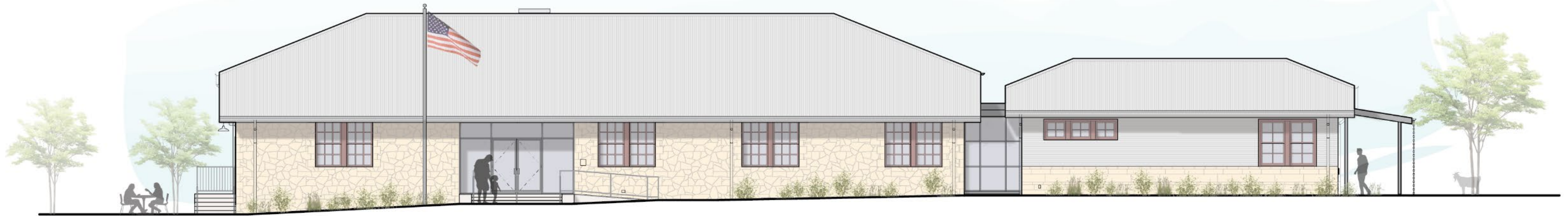
Revised East Elevation