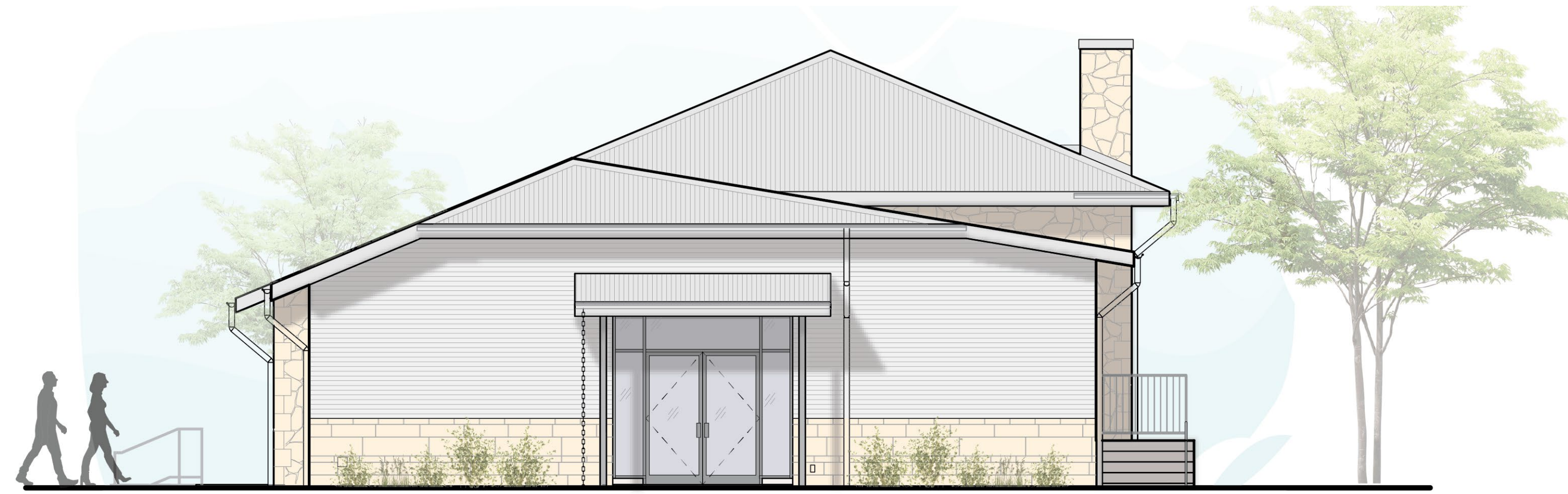
Revised North Elevation