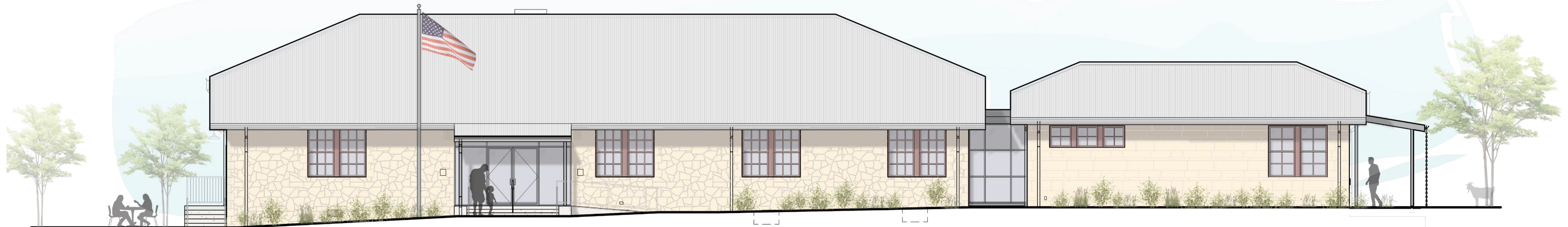
Previous East Elevation