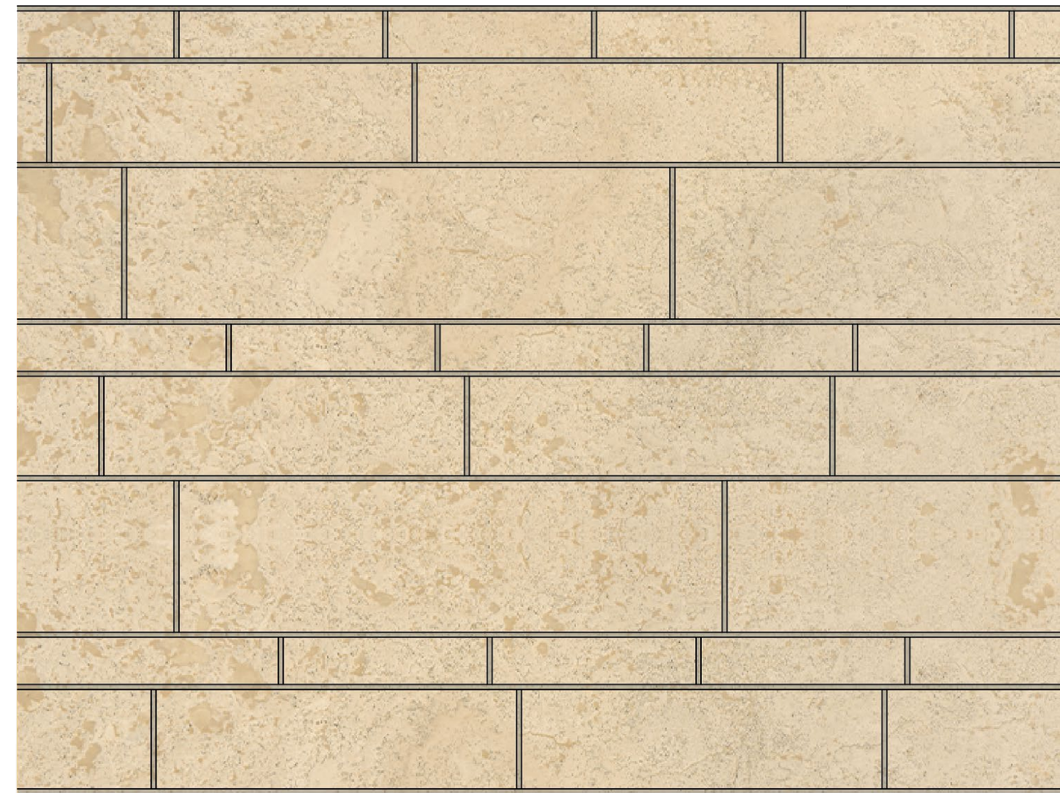
Matching Cordova cream limestone in ashlar pattern