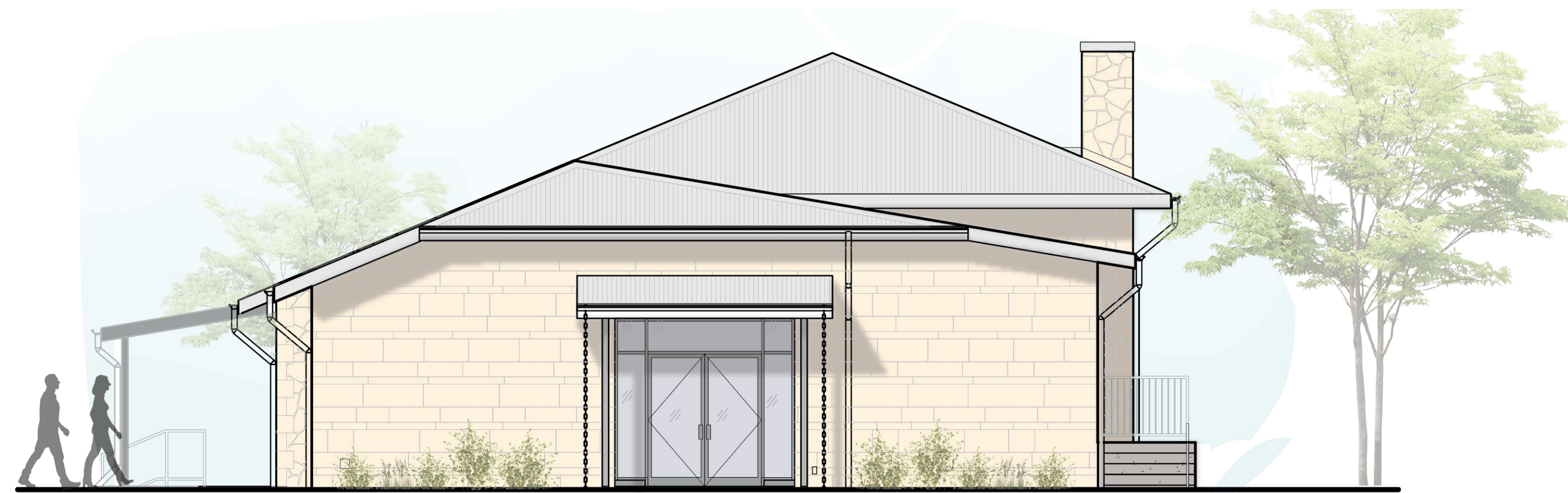
Previous North Elevation