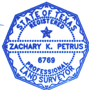
EXHIBIT "A" RIGHT-OF-WAY DEDICATION 0.152 ACRES

PHILIP SMITH SURVEY, ABSTRACT 415, CITY OF DRIPPING SPRINGS, HAYS COUNTY, TEXAS