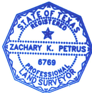
EXHIBIT "A" RIGHT-OF-WAY DEDICATION 0.152 ACRES

ZACHARY KEITH PETRUS REGISTERED PROFESSIONAL LAND SURVEYOR NO. 6769 10814 JOLLYVILLE ROAD CAMPUS IV, SUITE 200 AUSTIN, TEXAS 78759 PH. (512) 572-6674 ZACH.PETRUS@KIMLEY-HORN.COM