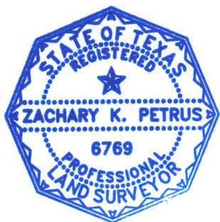
EXHIBIT "A" RIGHT-OF-WAY DEDICATION 0.152 ACRES

ZACHARY KEITH PETRUS REGISTERED PROFESSIONAL LAND SURVEYOR NO. 6769 10814 JOLLYVILLE ROAD CAMPUS IV, SUITE 200 AUSTIN, TEXAS 78759 PH. (512) 572-6674 ZACH.PETRUS@KIMLEY-HORN.COM