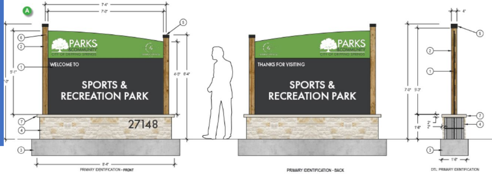
1 VEHICULAR IDENTIFICATION SIGNAGE