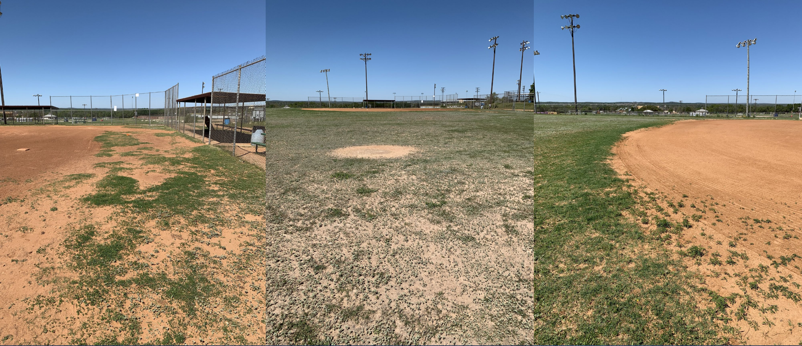
Sports & Recreation Park Adult Softball Improvements