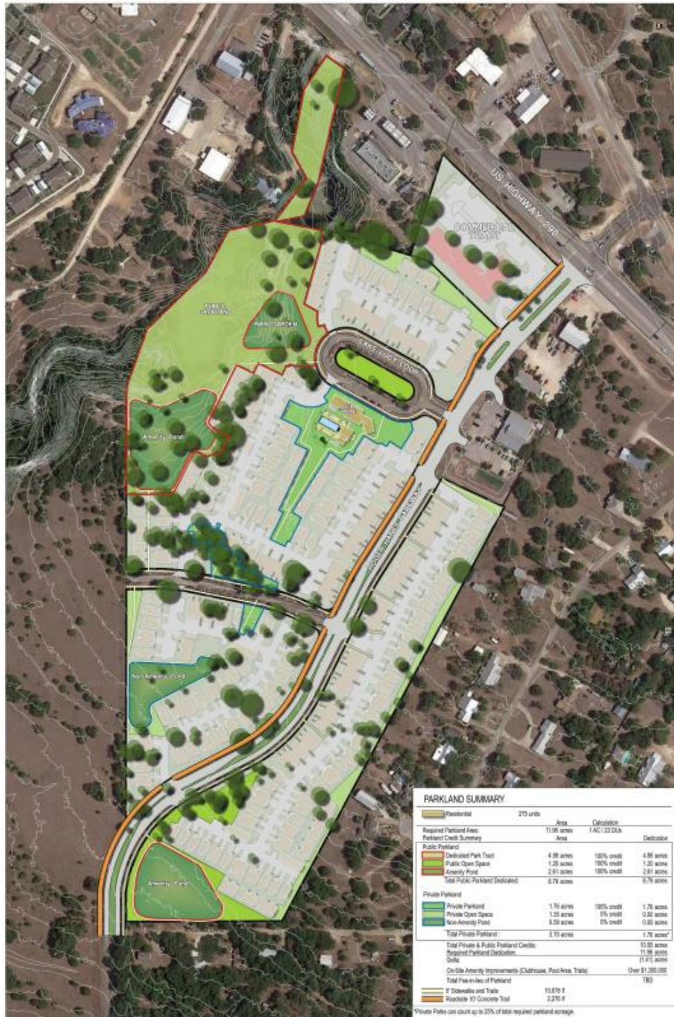
EXHIBIT "C" Parkland Area