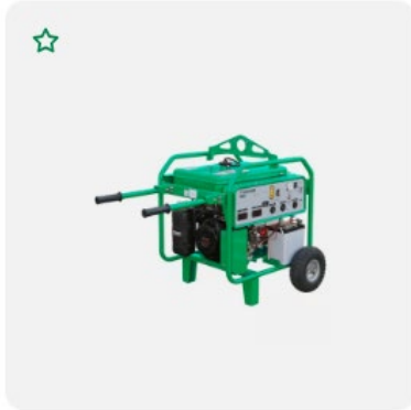
CAT CLASS: 0080002 3600 Watt Generator

-- requested a more detailed quote from Sunbelt Rentals staff