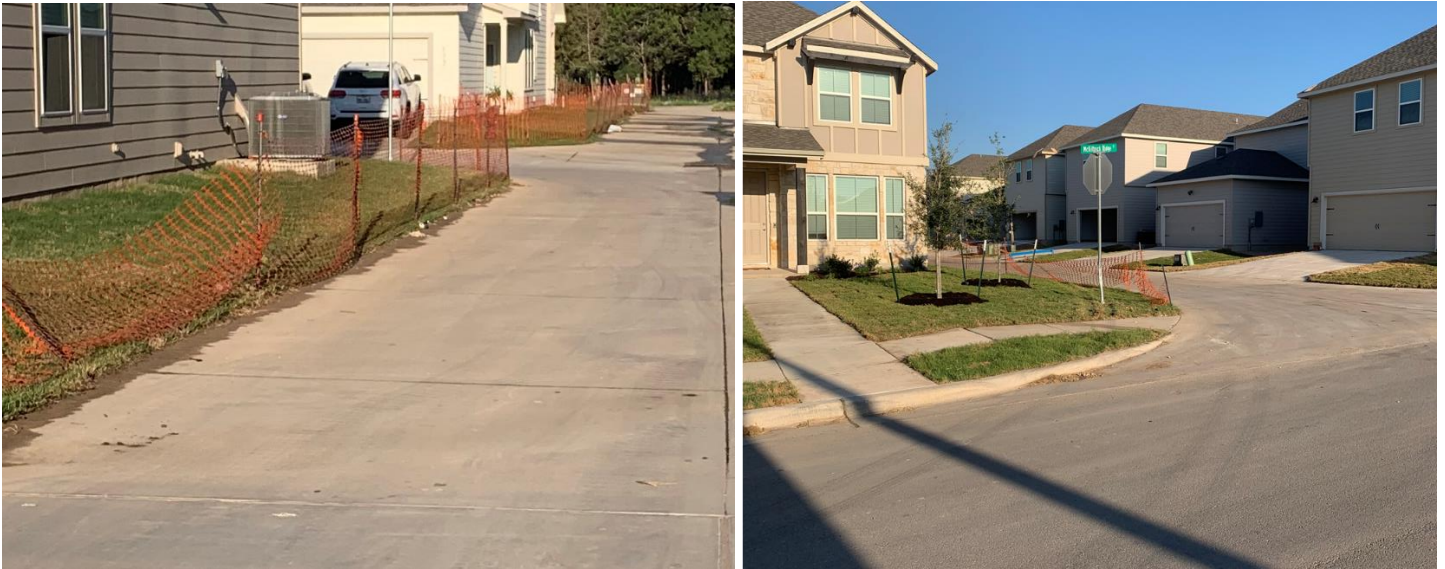
Figure 1: Images of properties that have the required 7.5' setback.