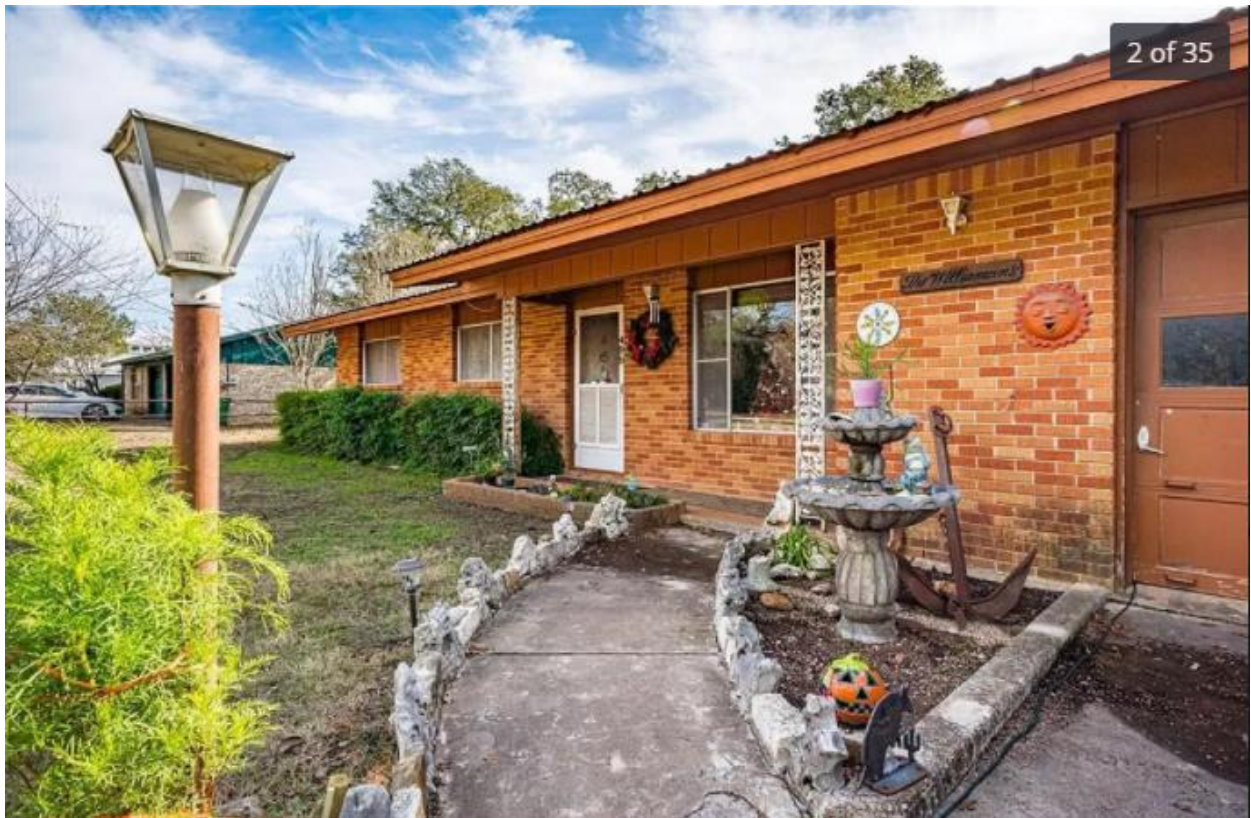
Front of property with view of adjacent property