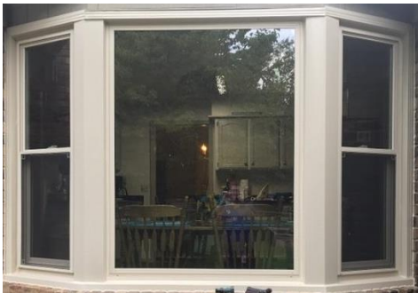
Almond - Windows