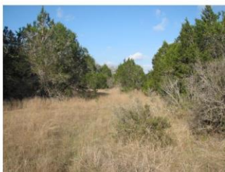
Austin philanthropist Dick Rathgeber has donated 300 acres to the city of Dripping Springs to be used as park land.