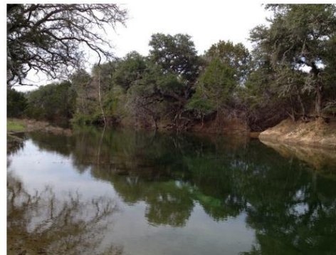
Austin philanthropist Dick Rathgeber has donated 300 acres to the city of Dripping Springs to be used as park land.

It's not every day that a city gets a $5.7 million parkland donation.