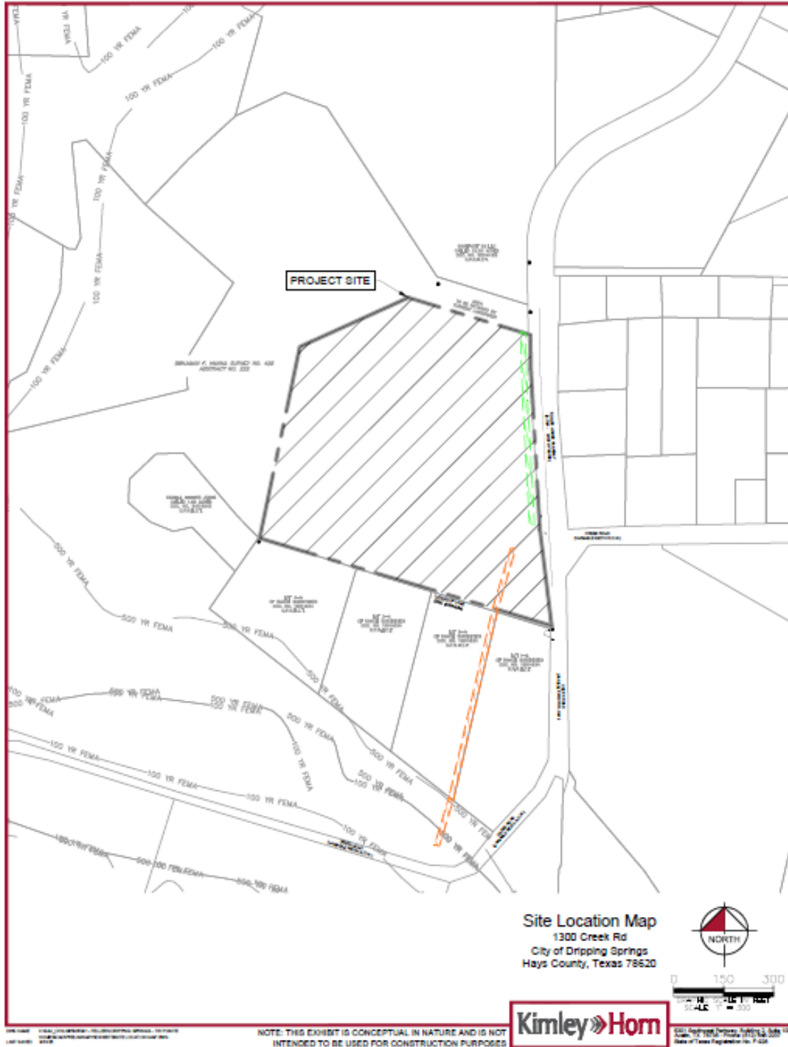
Exhibit A Map of the Land