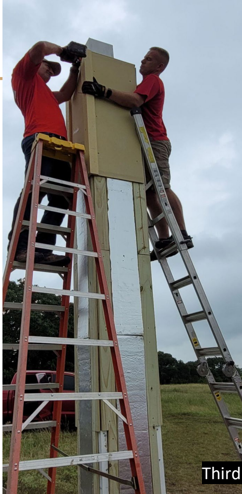
Third workday finishing the tower