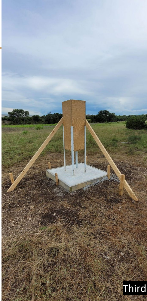
Third workday finishing the tower