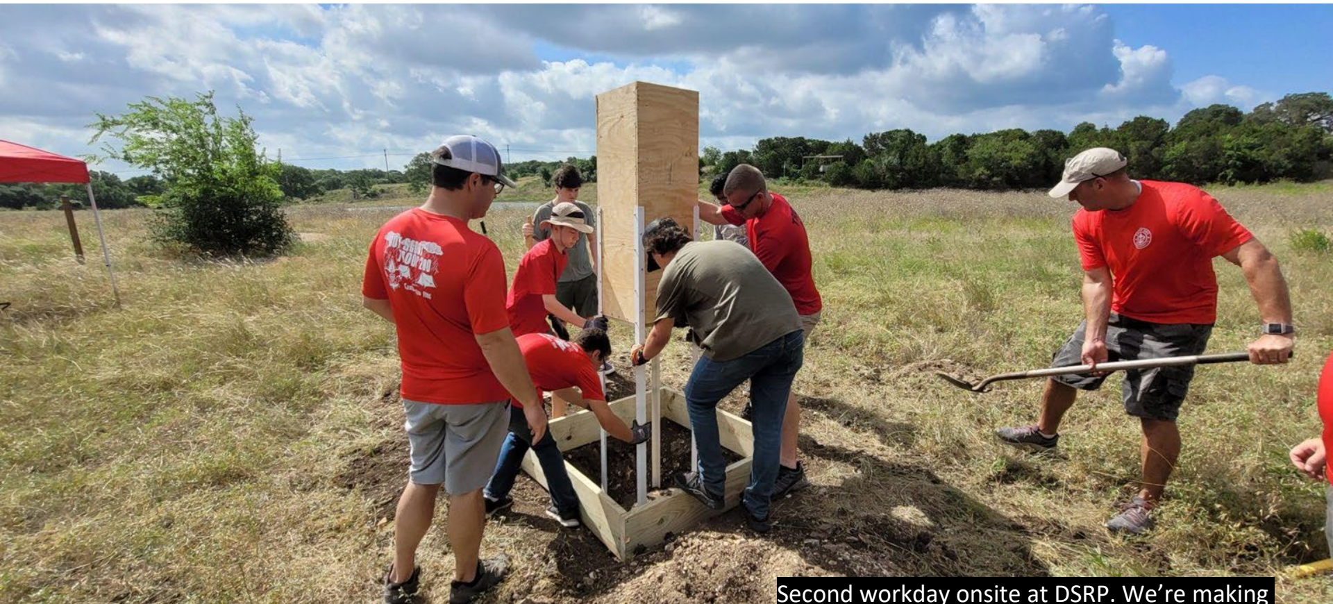
Second workday onsite at DSRP. We're making the foundation and tower bottom.