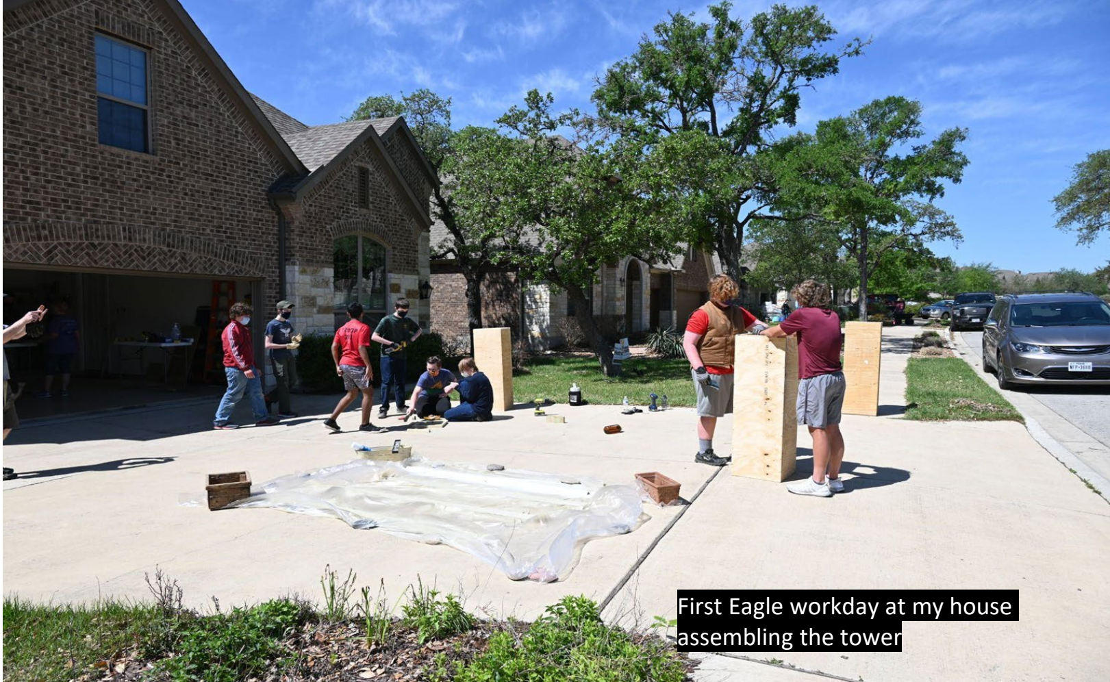
First Eagle workday at my house assembling the tower