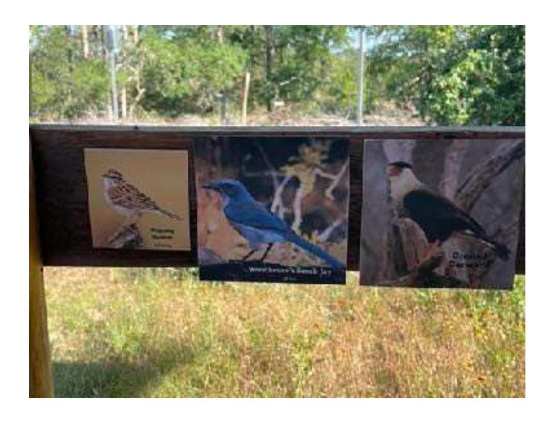
A view of 6" signs on 8" boards near roof of blind - north side.