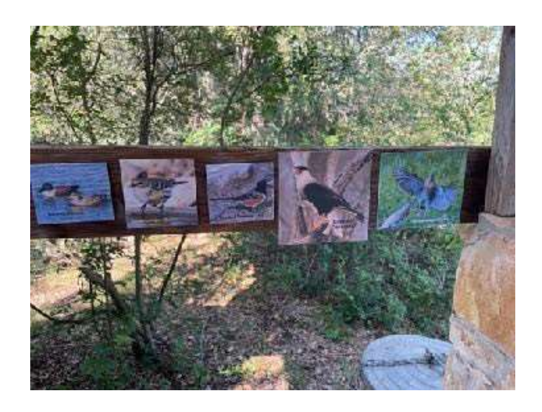
A view of both 4" and 6" signs - north side of blind facing feeding stations.