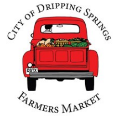
Charlie Reed, Farmers Market Manager

The Farmers Market continues to be extremely successful and new vendors reach out weekly to participate by submitting applications! The application process can be challenging and is in need of an overhaul but the new team is navigating it as is, at the moment. The Farmers Market has averaged 40 vendors per market for the month of April.