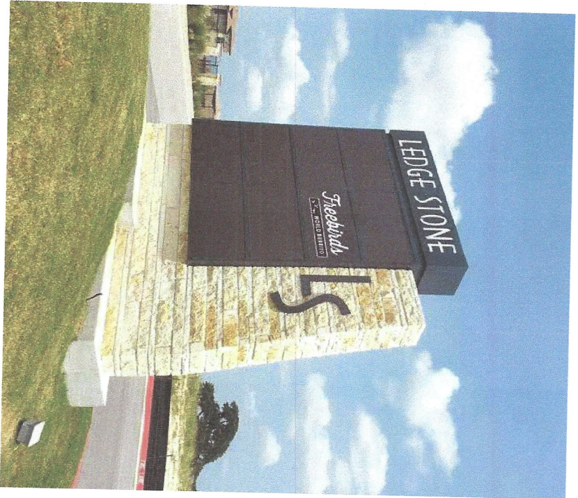
LEGE STONE SIGN #3 PERSPECTIVE LOCATION VIEW NTS