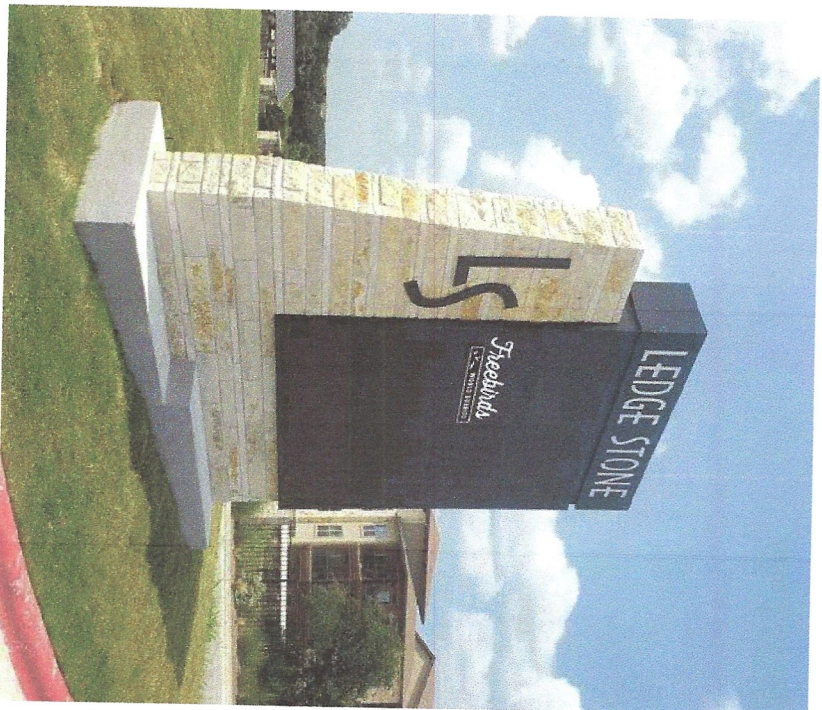
LEGE STONE SIGN #3.1 PERSPECTIVE LOCATION VIEW NTS