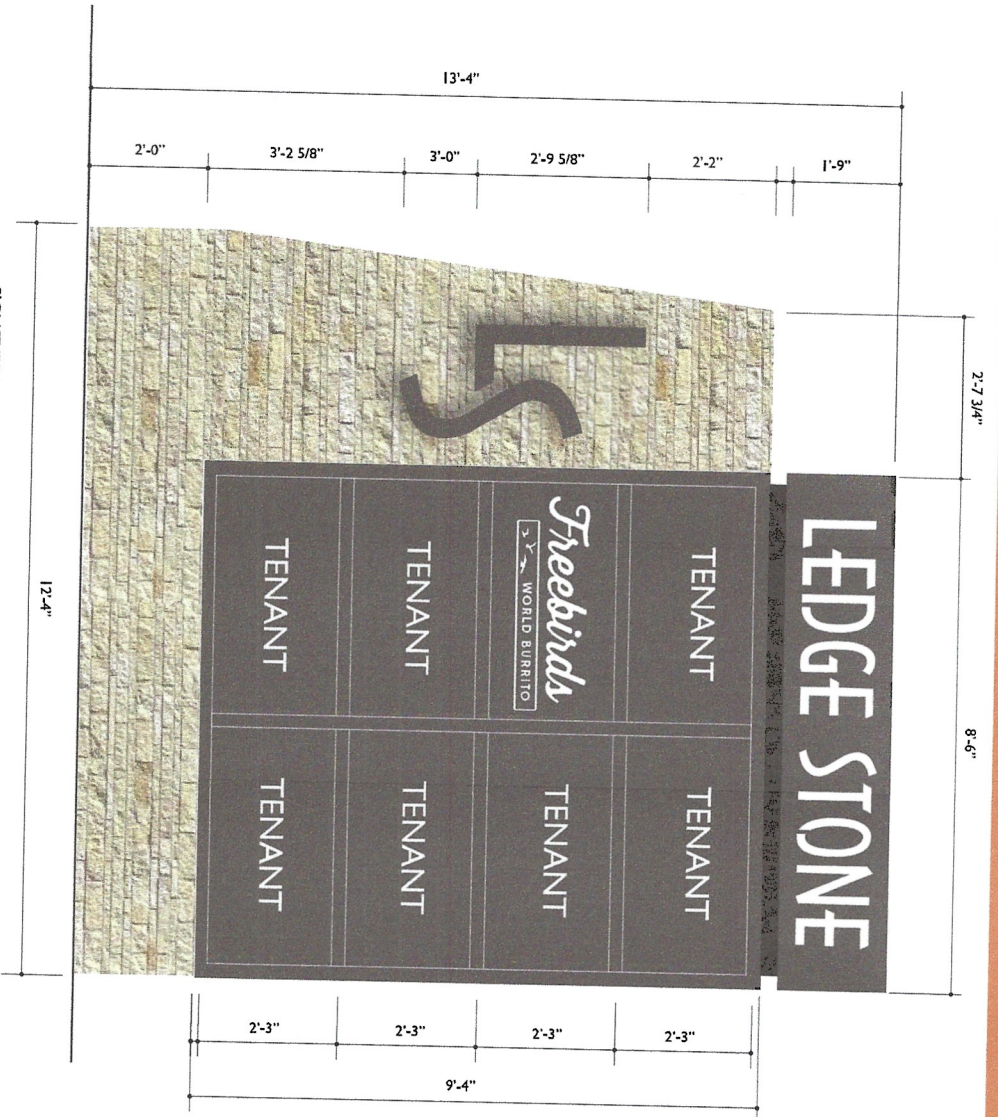
SIGN TYPE 3 AND 3.1 • LAYOUT FRONT VIEW (BACK VIEW IS SIMILAR)

DOUBLE FACE INTERNALLY ILLUMINATED ALUMINUM MULTI-TENANT SIGN CABINET PAINTED MBGI MIDDNIGHT BRONZE - 2 1/2" DIVIDERS, ROUTED OUT GRAPHICS BACKED WITH WHITE PLEXI \ 3000 K LED, OUTDOOR LIGHTING ORDINANCE COMPLIANT ILLUMINATION.