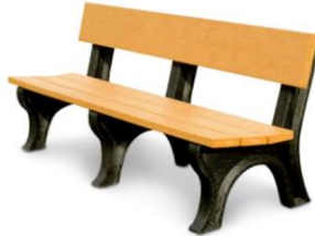
Model LB6WB-P Cedar Seat | Black Frame

Constructed of eco-friendly, maintenance-free 100% recycled plastic using a 2" x 10" back board for strength and durability. These memorial benches are an outstanding symbol of Green Products for a Greener World. These benches can be securely fastened in place using the optional anchor kit. Available in the colors shown below. All stainless steel fasteners included.