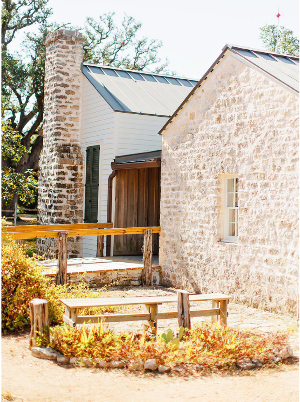
The Pound House Museum