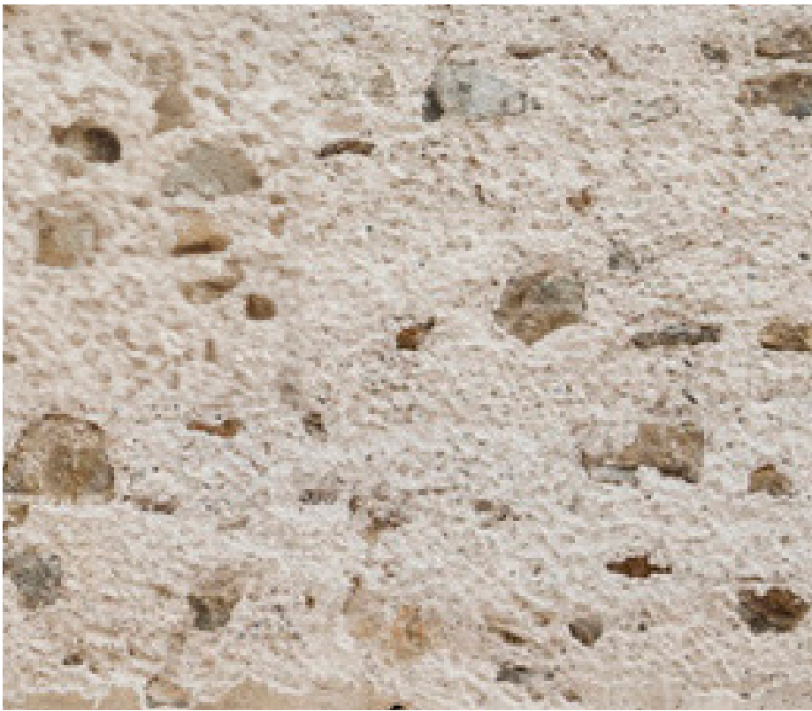
Rubble limestone with heavy mortar smear