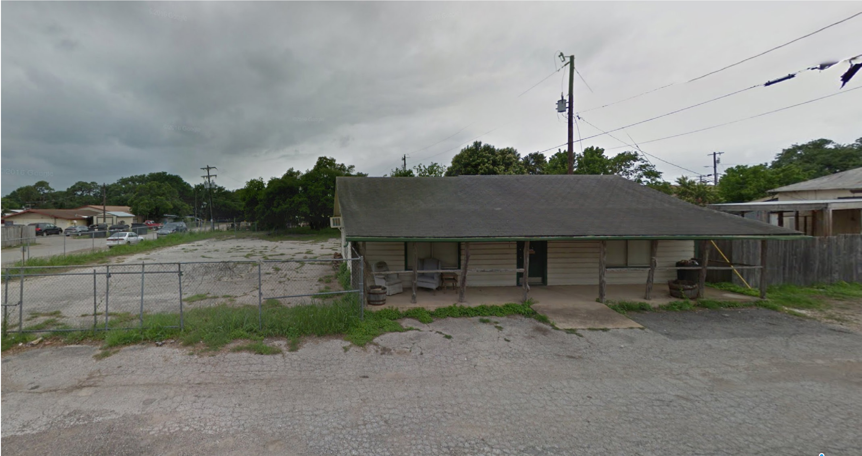
Existing structure from San Marcos Street