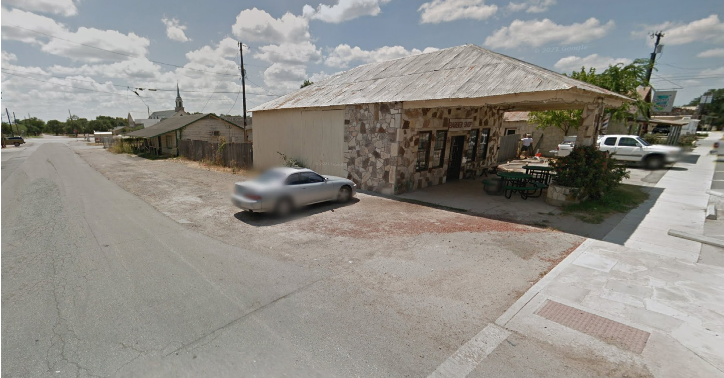
Existing structure from corner of Mercer Street and San Marcos Street