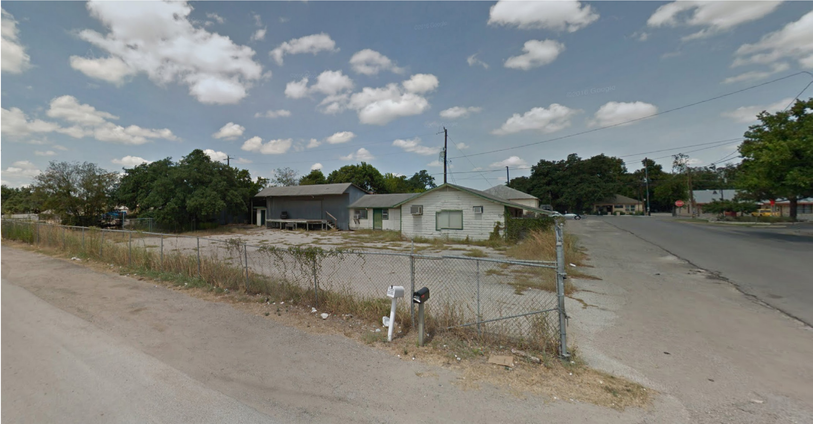
Existing structure from corner of San Marcos Street and Wallace Street