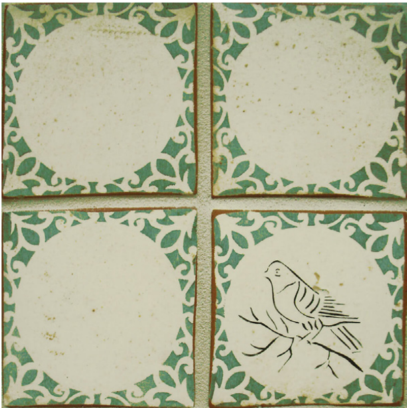
Accent tile at planters