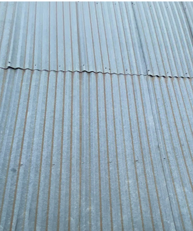
Reclaimed metal panel from existing wood shed