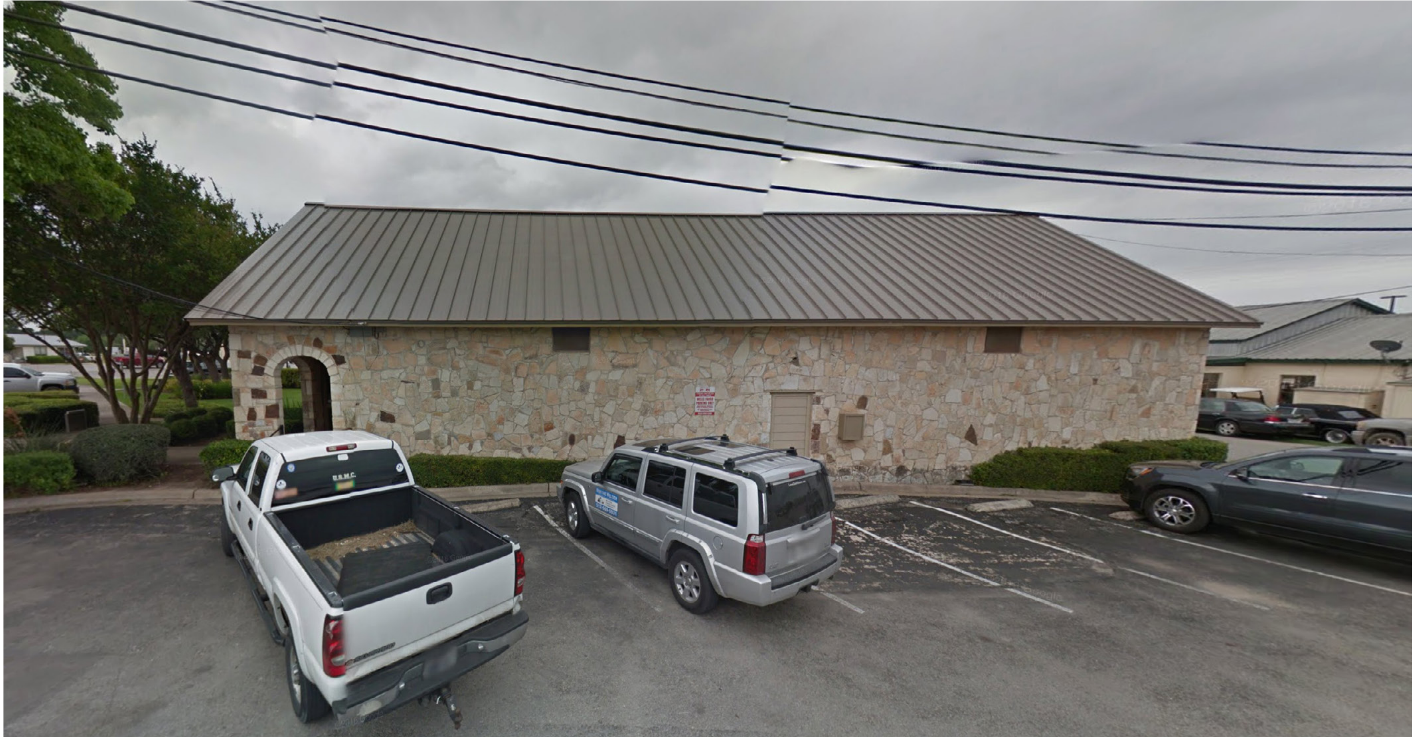
Wells Fargo across San Marcos Street