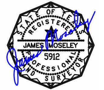
See Drawing Attached

Thence, N 05°15'47" E, across the remainder of said 81.7176 Acre Tract, a distance of 311.23 feet to the POINT OF BEGINNING and containing 5.3379 acres or 232,517 square feet of land, more or less.