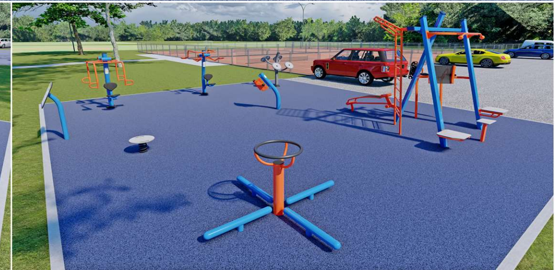
City of the Village of Douglas Schultz Park Playground