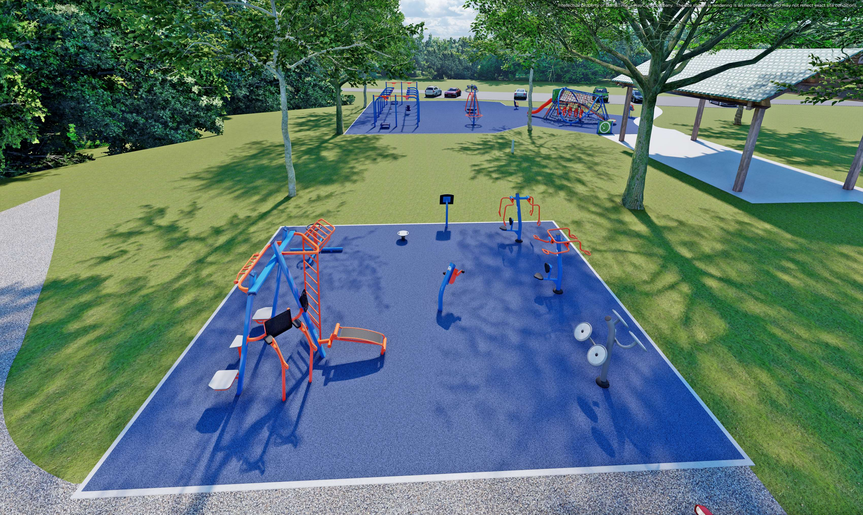
City of the Village of Douglas Schultz Park Playground