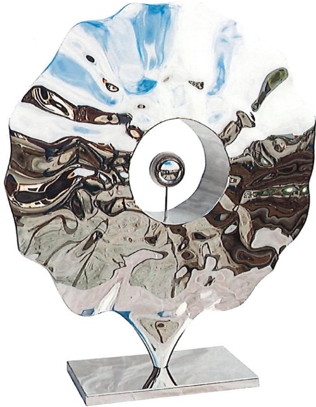
Expansion | Mirrored Stainless Steel | 100 x 82 cm (39.5 x 32.5 in) | 2016