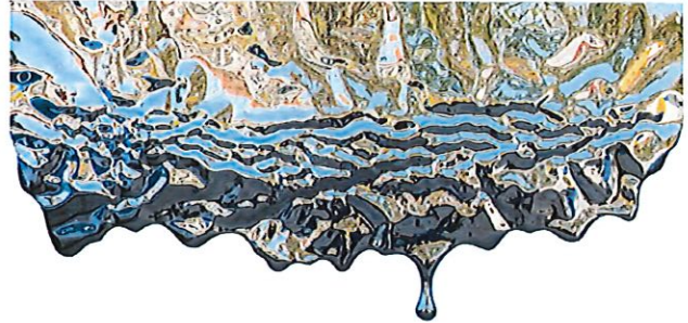
Monumental Melt | Mirrored Stainless Steel | 150 x 350 cm (59 x 138 in) | 2016