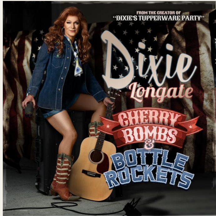
Dixie Longate Cherry Bombs + Bottle Rockets May 22 + 23