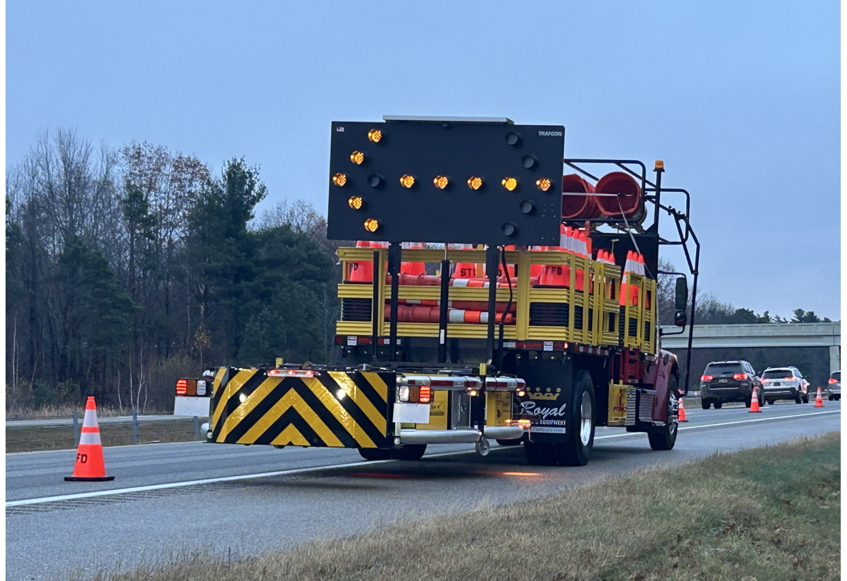
2120 TMA on its maiden response on I-196 blocking 1 lane of traffic.

The TMA's ability to respond to incidents quickly and efficiently since its deployment in late November 2024 is impressive. With 24 responses by April 26, it's clear that this apparatus is already making a positive impact on safety for our team and other first responders.