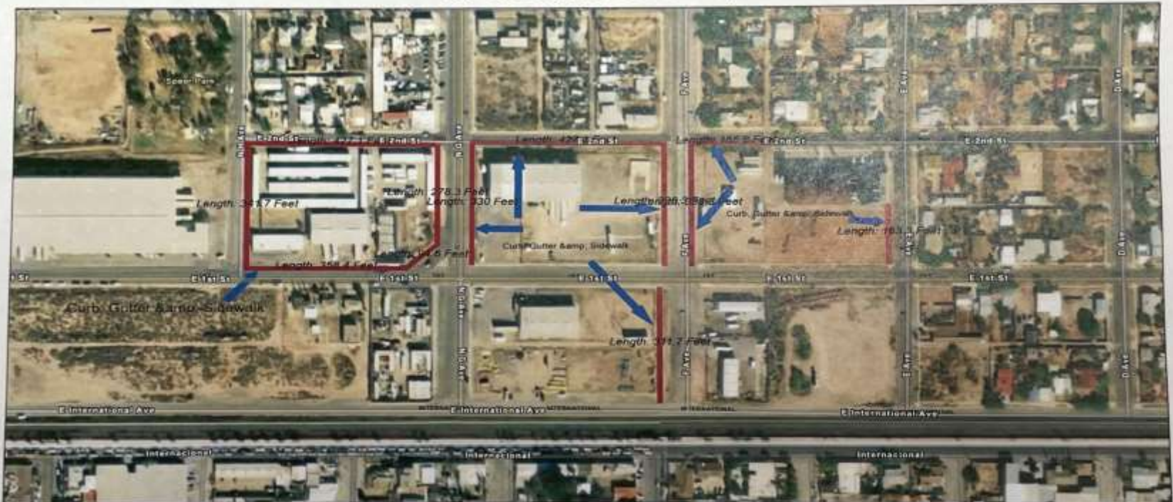
City of Douglas: CDBG Project