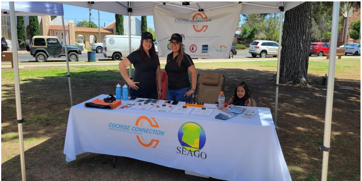
TRANSIT DEPARTMENT "DOUGLAS RIDES" PARTICIPATION AT DOUGLAS DAYS EVENT