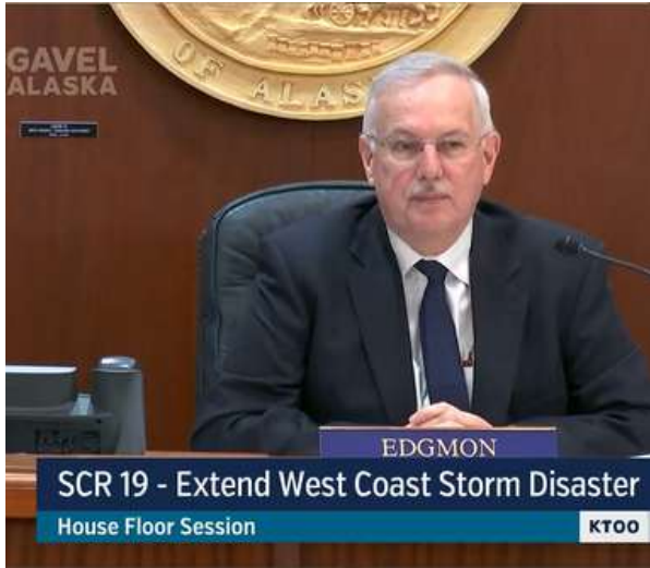
Hearing the disaster declaration on the House floor

Alaskans are still recovering, and communities still need housing, services, and security to rebuild their lives. Timely action is critical to avoid delays that would increase costs and slow progress. The Disaster Relief Fund has a sufficient balance to cover these costs, and I will continue working with the Dunleavy administration and our federal partners to make sure our communities get the support they need.