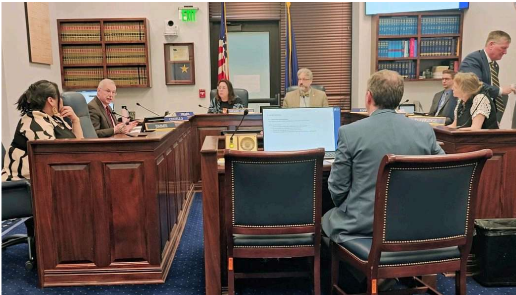
Addressing the House Special Committee on Energy on the fuel supply crisis facing rural Alaska