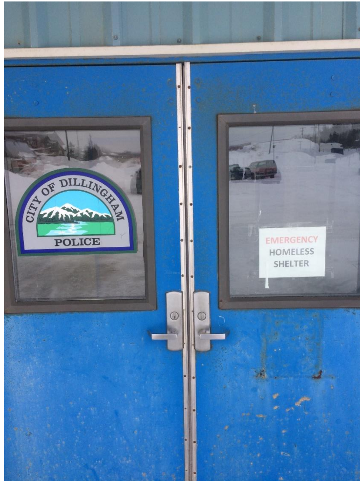
Front doors of police station with "Emergency Homeless Shelter" sign.

Despite the momentum of the homeless meetings it became obvious that no permanent alternative shelter solution was going to come to fruition this winter. This month we had extremely low temperatures in Dillingham. So, pandemic or not, we decided to reopen our lobby to homeless persons so that they would have a warm place to sleep at night.