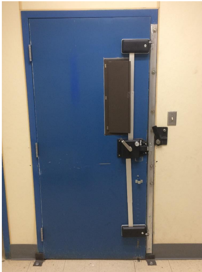
Cell 5 door with new robust security locking system.

We are finally getting some long requested and much needed maintenance done at our jail. The Harbormaster and Buildings and Grounds personnel installed an extremely robust security lock on cell 5. This cell is our secure cell where violent, mostly intoxicated or drugged, inmates are held. The door has been beaten so hard for so long that it was in danger of literally falling out of the wall. They did an excellent job fixing the door.