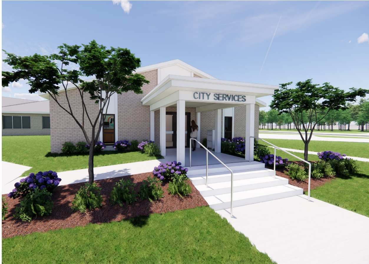
PROPOSED FRONT ENTRY