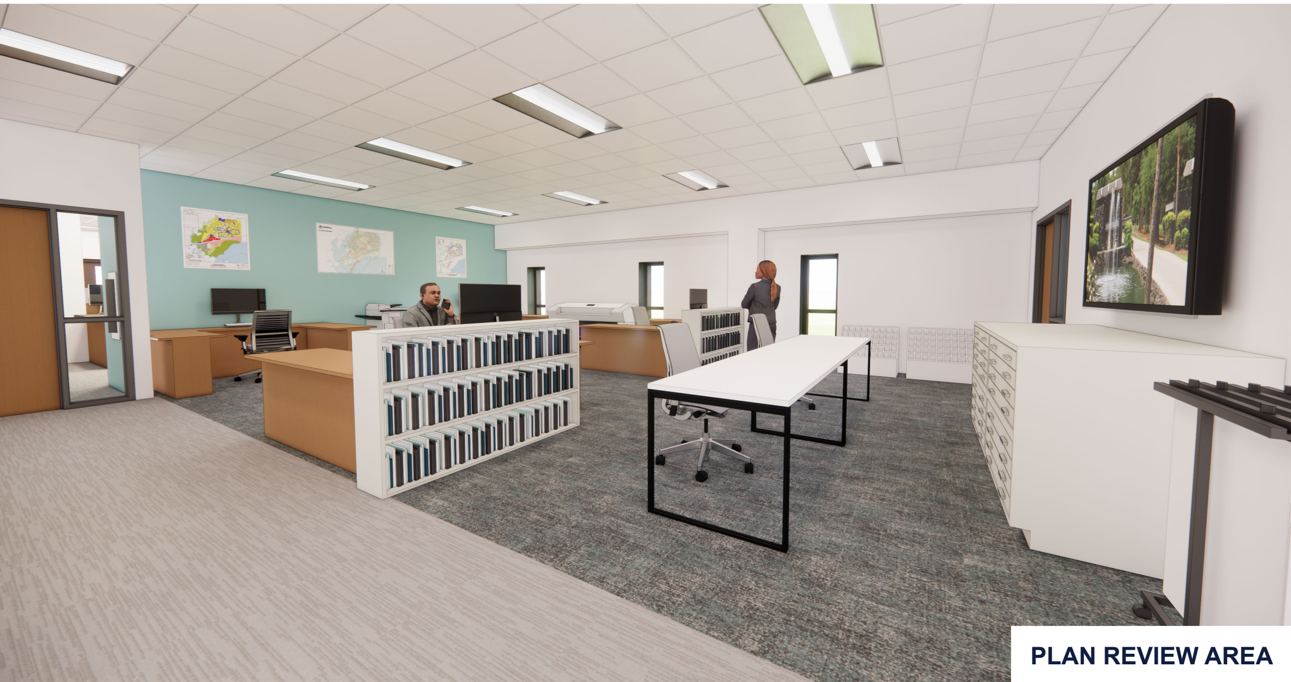
PLAN REVIEW AREA