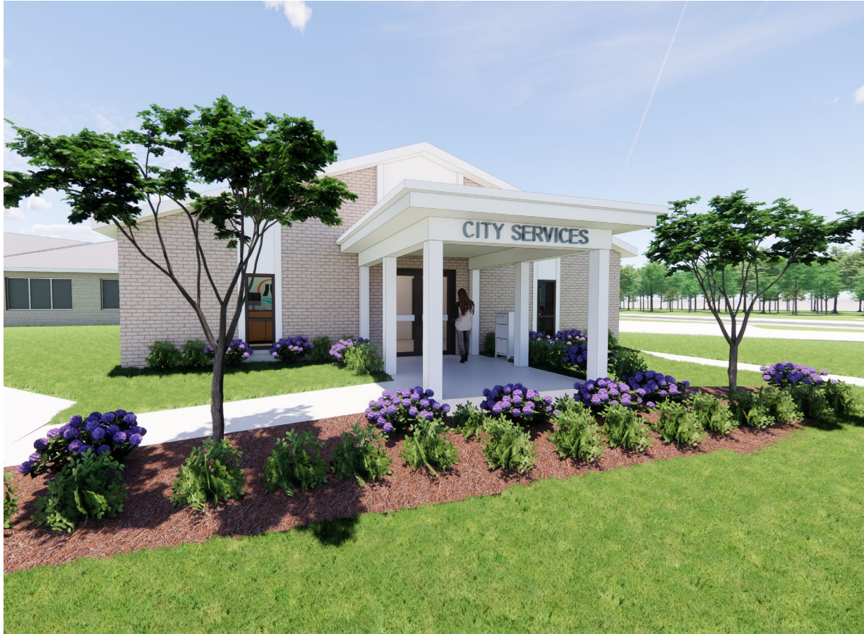
BASE BID FRONT ENTRY