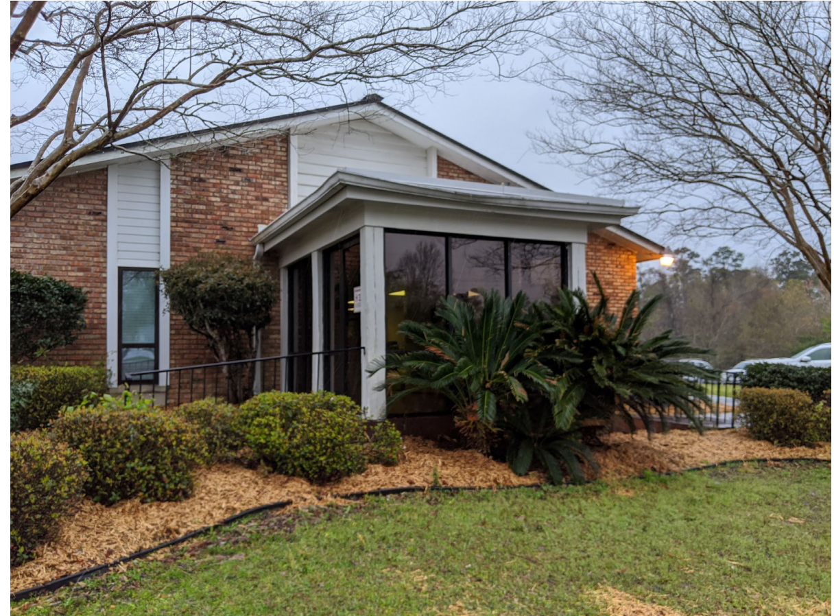
EXISTING FRONT ENTRY