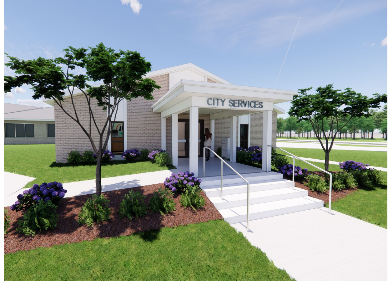
ALTERNATE FRONT ENTRY