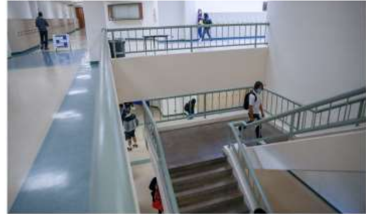
Ⓜ An $18 million bill that would have expanded school health centers failed in the Legislature.

Oregon lawmakers failed to put nearly $18 million into school-based health centers that provide drug and mental health counseling among other services