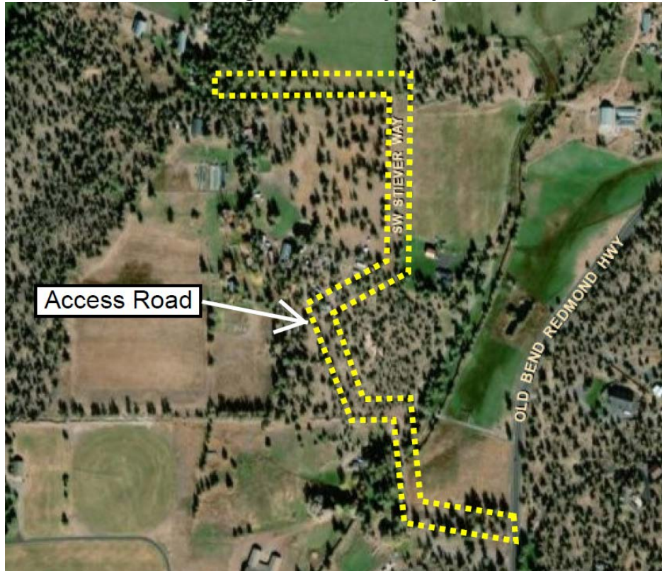
Figure 1 - Vicinity Map

AFFECTED PROPERTIES: A list of the properties that front on the unnamed roadway is provided below: