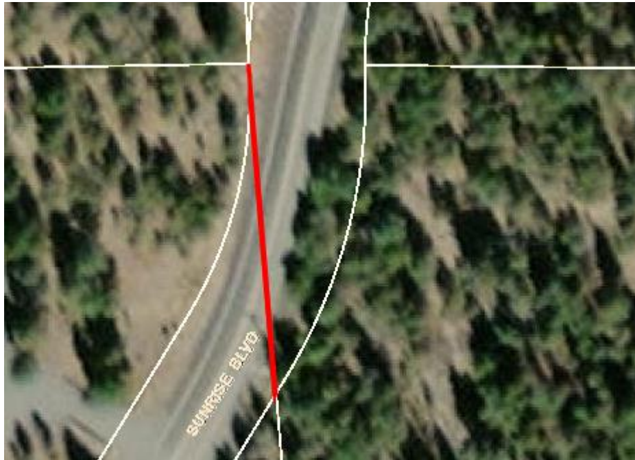
FIGURE 2 – Tax Lot 211029D000099

Tax Lot 211029D000099 was created as a 1 foot-wide reserve strip for Sunrise Boulevard with the Forest View subdivision plat (1971), but the reserve strip, identified as Parcel "C" on the plat, was not properly conveyed to Deschutes County with the plat. Deschutes County acquired the subject property in 1999 by tax deed recorded as Deed No. 1999-13087.