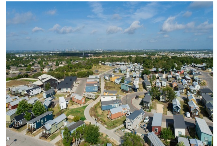
Photo of permanent housing at Community First! Village in Austin, Texas