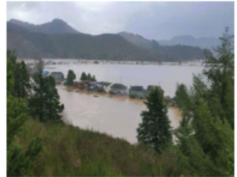
The National Flood Insurance Program serves to protect lives and property, while reducing costs to taxpayers due to flooding loss.

FEMA is evaluating proposed changes to the NFIP outlined in the Implementation Plan through an environmental impact statement (EIS), in compliance with the National Environmental Policy Act (NEPA).