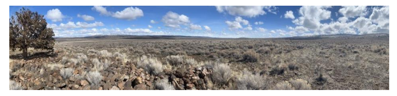
Figure 5. Roth East Site Photo