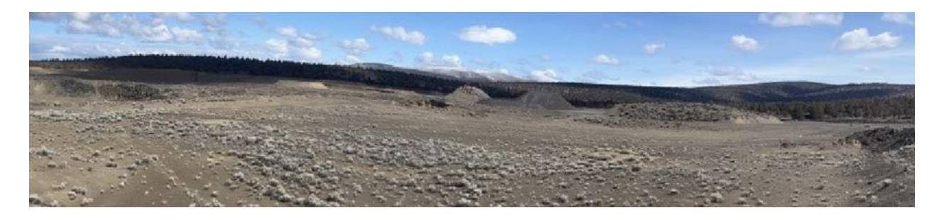
Figure 3. Moon Pit Site Photograph