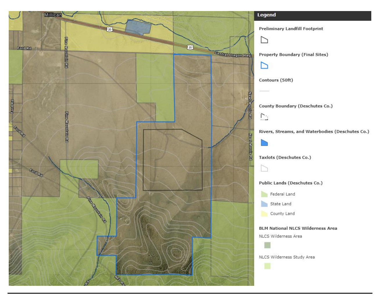
Figure 4. Roth East Site Map

See Appendix C for Site Owner Solicitation Responses with terms and prices for acquisition.