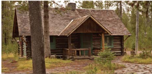
Elk Lake Guard Station

27. Elk Lake Guard Station: A wagon road built in 1920 between Elk Lake and Bend sparked a wave of tourism around the scenic waterfront. To protect natural resources of the Deschutes National Forest and provide visitor information to guests, the Elk Lake Guard Station was constructed in 1929 to house a forest guard.