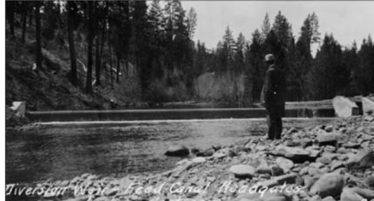
Tumalo Creek – Diversion Dam

19. Tumalo Creek – Diversion Dam The original headgate and diversion dam for the feed canal was constructed in 1914. The feed canal's purpose was to convey water from Tumalo Creek to the reservoir. The original headworks were replaced and the original 94.2 ft low overflow weir dam was partially removed in 2009/2010 to accommodate a new fish screen and fish ladder. The remaining original structure is a 90 foot (crest length) section of dam of reinforced concrete. Tax Map 17-11-23, Tax Lot 800 & 1600.