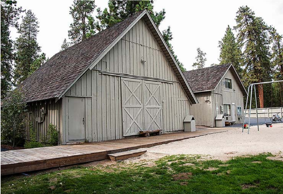
Photo: Swamp Ranch https://www.deschutes.org/cd/page/historic-preservation