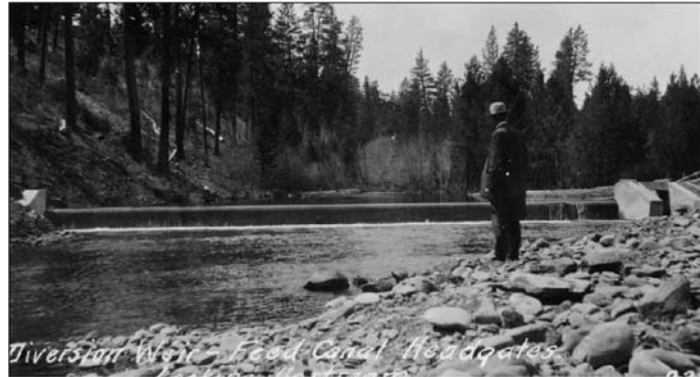
Tumalo Creek – Diversion Dam

29. Tumalo Creek – Diversion Dam The original headgate and diversion dam for the feed canal was constructed in 1914. The feed canal's purpose was to convey water from Tumalo Creek to the reservoir. The original headworks were replaced and the original 94.2 ft low overflow weir dam was partially removed in 2009/2010 to accommodate a new fish screen and fish ladder. The remaining original structure is a 90 foot (crest length) section of dam of reinforced concrete. Tax Map 17-11-23, Tax Lot 800 & 1600.