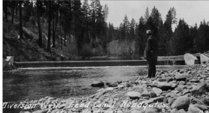
Tumalo Creek – Diversion Dam

29. Tumalo Creek – Diversion Dam The original headgate and diversion dam for the feed canal was constructed in 1914. The feed canal's purpose was to convey water from Tumalo Creek to the reservoir. The original headworks were replaced and the original 94.2 ft low overflow weir dam was partially removed in 2009/2010 to accommodate a new fish screen and fish ladder. The remaining original structure is a 90 foot (crest length) section of dam of reinforced concrete. Tax Map 17-11-23, Tax Lot 800 & 1600.