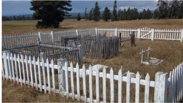
Allen Ranch Cemetery