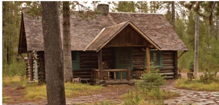
Elk Lake Guard Station

37. Elk Lake Guard Station: A wagon road built in 1920 between Elk Lake and Bend sparked a wave of tourism around the scenic waterfront. To protect natural resources of the Deschutes National Forest and provide visitor information to guests, the Elk Lake Guard Station was constructed in 1929 to house a forest guard.