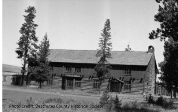
Camp Abbot Site, Officers' Club

9. Camp Abbot Site, Officers' Club: Officers' Club for former military camp, currently identified as Great Hall in Sunriver and used as a meeting hall. 20-11-5B TL 112.