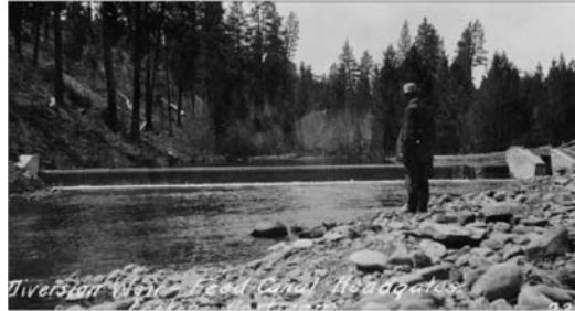
Tumalo Creek – Diversion Dam

The original headgate and diversion dam for the feed canal was constructed in 1914. The feed canal's purpose was to convey water from Tumalo Creek to the reservoir. The original headworks were replaced and the original 94.2 ft low overflow weir dam was partially removed in 2009/2010