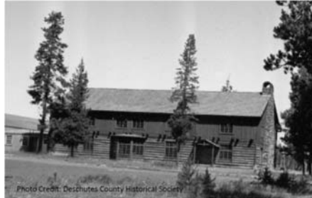
Camp Abbot Site, Officers' Club

9. Camp Abbot Site, Officers' Club: Officers' Club for former military camp, currently identified as Great Hall in Sunriver and used as a meeting hall. 20-11-5B TL 112.