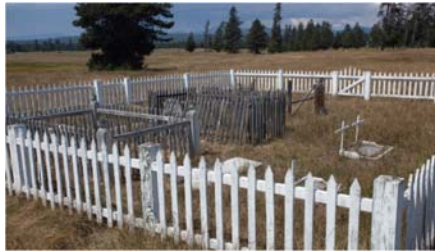
Allen Ranch Cemetery