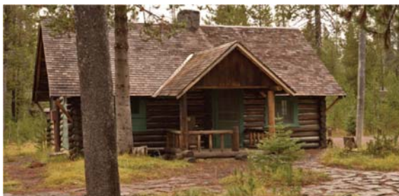
Elk Lake Guard Station

37. Elk Lake Guard Station: A wagon road built in 1920 between Elk Lake and Bend sparked a wave of tourism around the scenic waterfront. To protect natural resources of the Deschutes National Forest and provide visitor information to guests, the Elk Lake