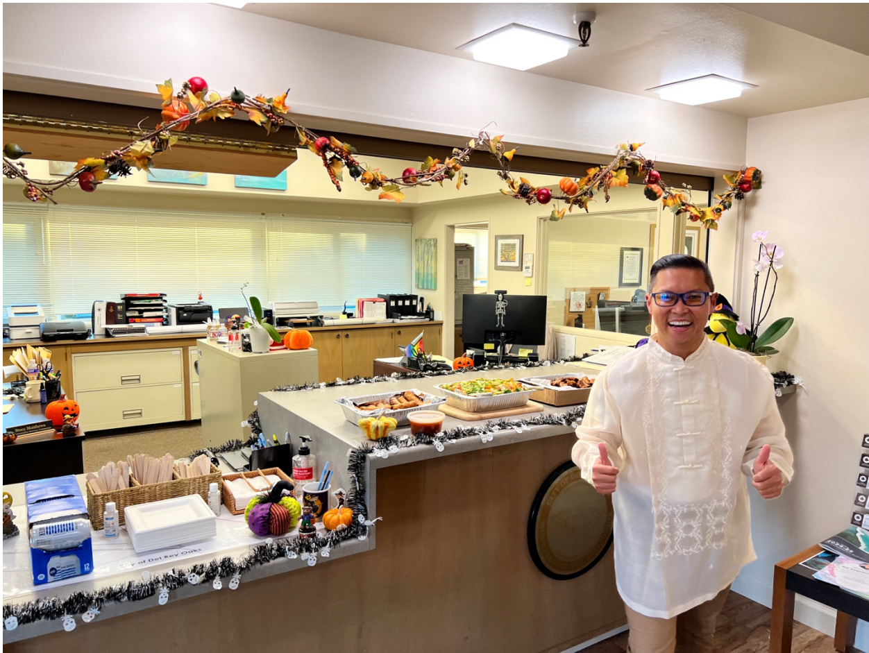
Photo caption: Celebrating Filipino-American History Month with a taste of tradition! I was honored to bring Filipino favorites—crispy lumpia and savory pancit—to our City Council meeting. It's a joy to share these dishes with everyone, honoring the rich heritage and contributions of Filipino-Americans to our community. Mabuhay!

In New Business, we reviewed the Project Specific Maintenance Agreement (PSMA) with Caltrans for the Fort Ord Recreation Trail and Greenway (FORTAG) . This project aligns with our goals to expand public access to nature and enhance recreational spaces for residents and visitors alike. The discussion covered several key aspects to ensure that FORTAG will be a long-lasting and sustainable asset to our community.