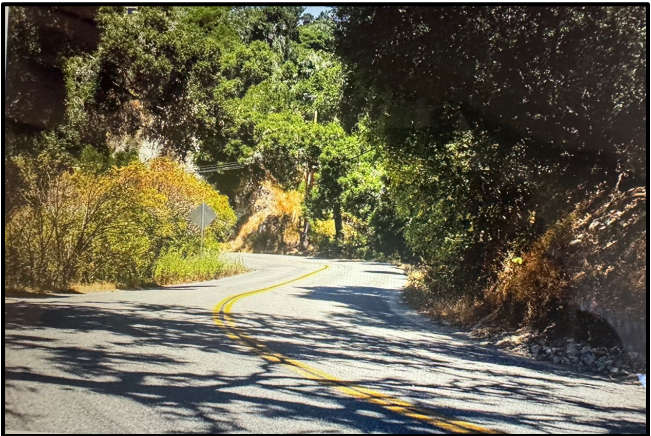
A Curve in Carmel Valley Road

Public involvement is essential for the planning, safety, and maintenance of roads. Monterey County residents and visitors benefit when it is easy for them to participate and report unsafe conditions.