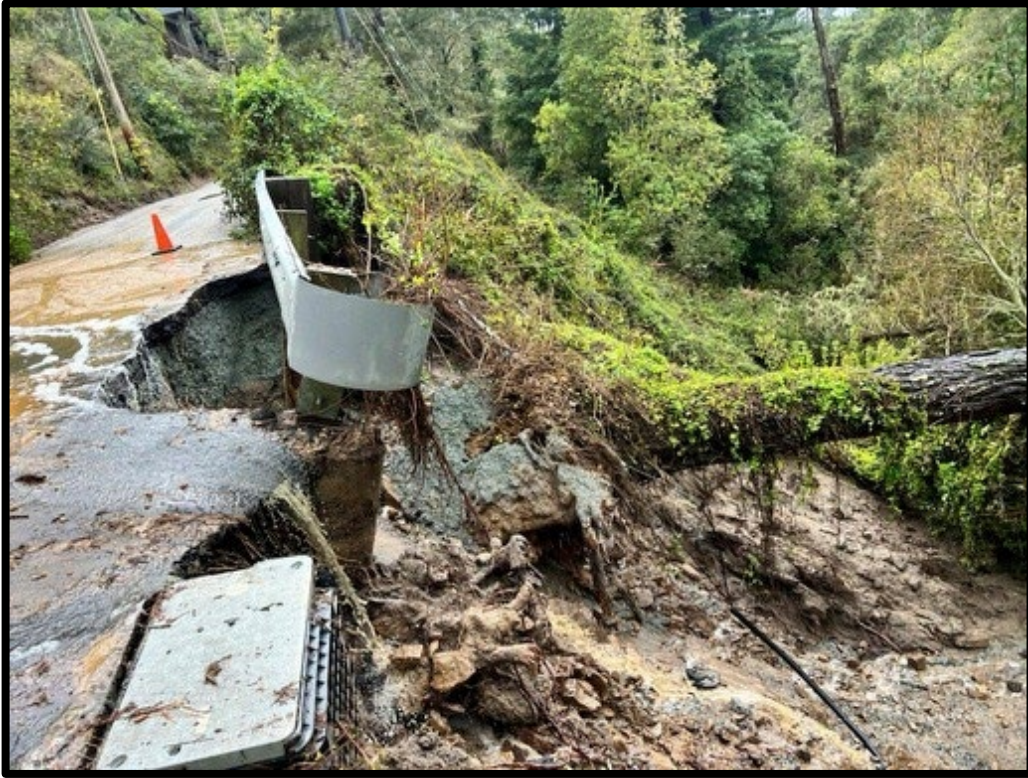
Source: Photo of Fern Canyon Road, near Carmel Highlands, posted 2/13/25 on Monterey County Facebook page. The road was subsequently closed.