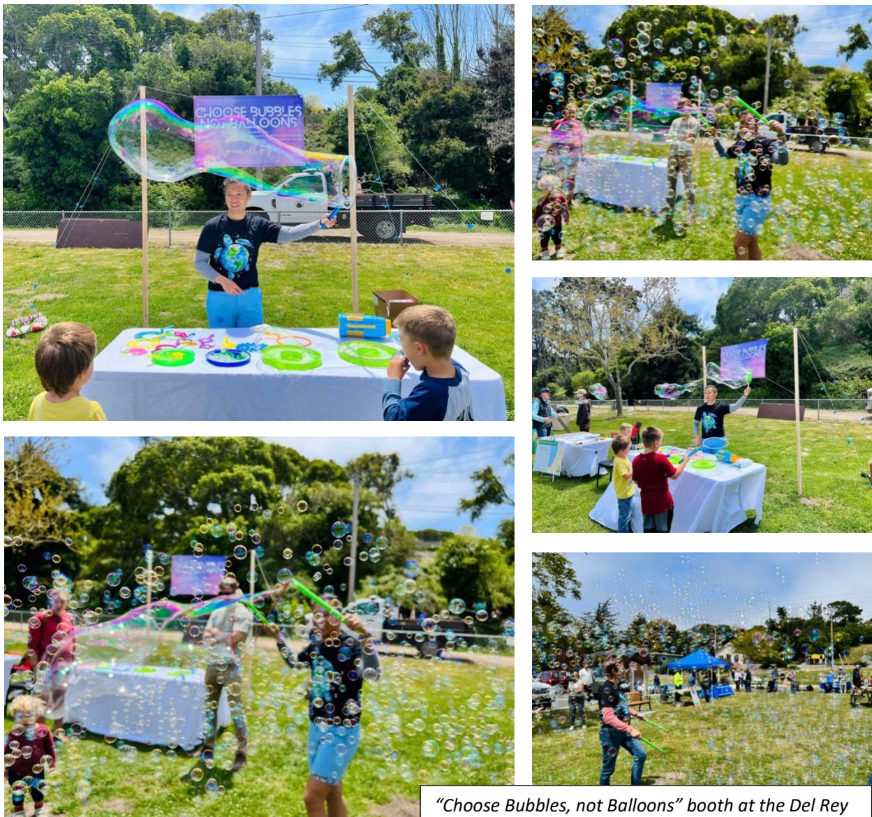
"Choose Bubbles, not Balloons" booth at the Del Rey Oaks Earth Day Celebration last April 29, 2023.

Last year, I had the privilege of showcasing a booth centered around the initiative "Choose Bubbles, Not Balloons," a cause close to my heart. While I am unable to personally advocate for this initiative this year, I encourage each of you to explore the various exhibits and engage with the important conversations surrounding environmental sustainability.