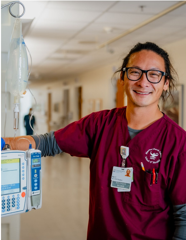
MPC & CSUMB partnerships