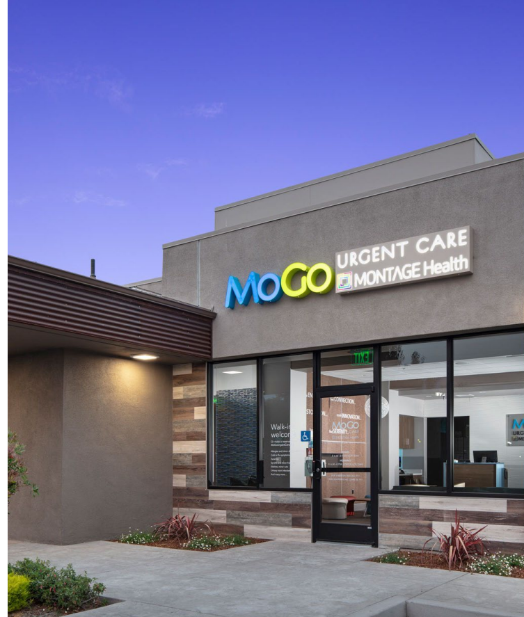
MoGo Urgent Care 3 locations across the peninsula 48,000 patient visits annually