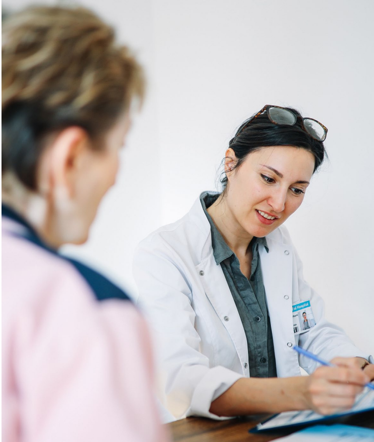
Montage Medical Group 30+ specialties 230,000 patient visits annually