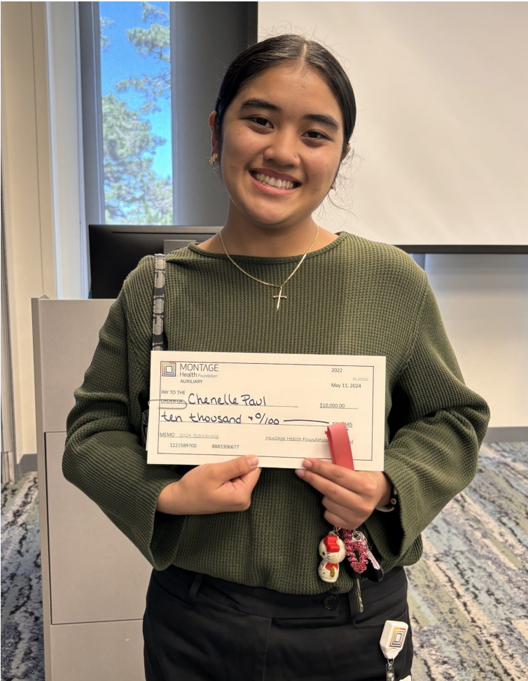
Healthcare Careers Academy