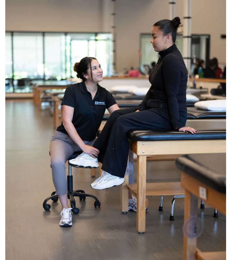
NEW: Montage Orthopedics & Sports Medicine