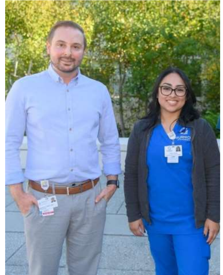
Clinical Careers Program