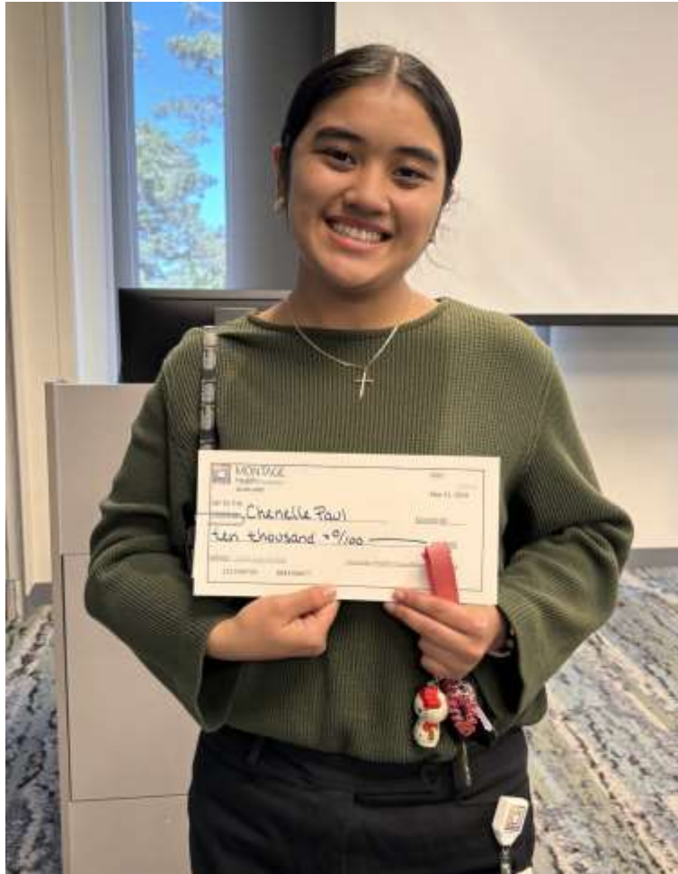
Healthcare Careers Academy