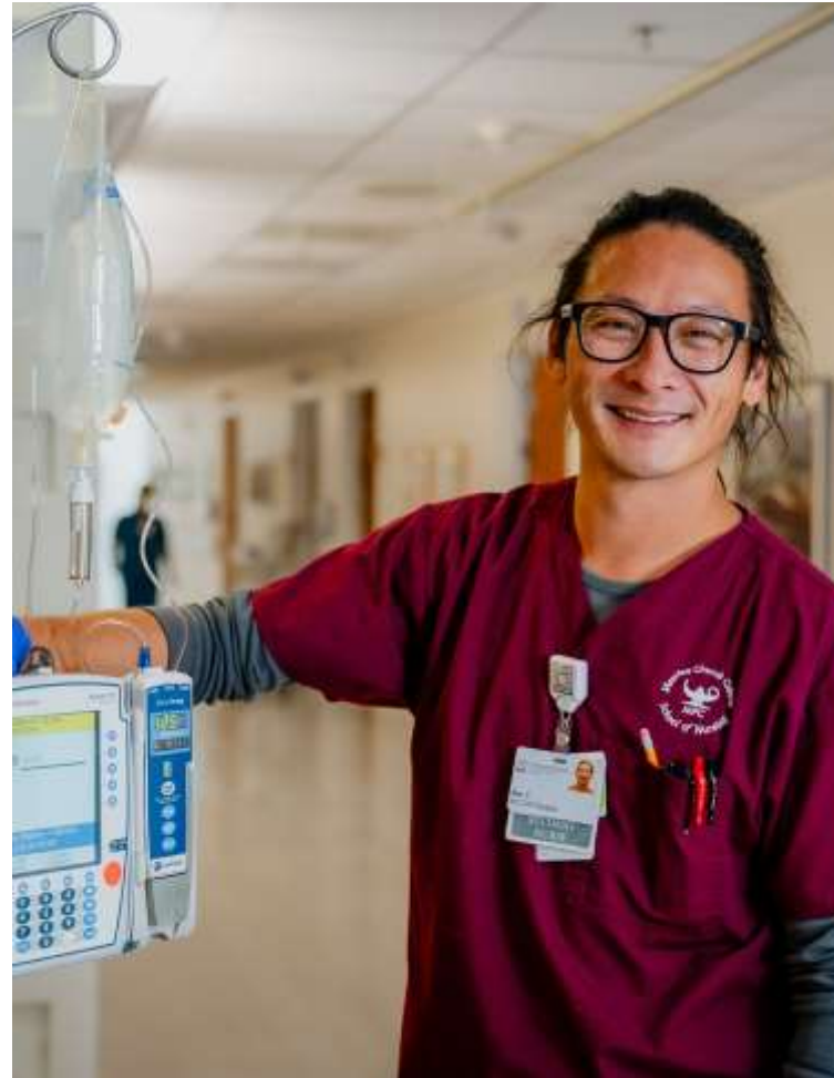
MPC & CSUMB partnerships