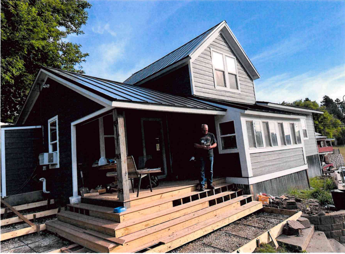
EXAMPLE - HOUSE JUST COMPLETED IN LEAD