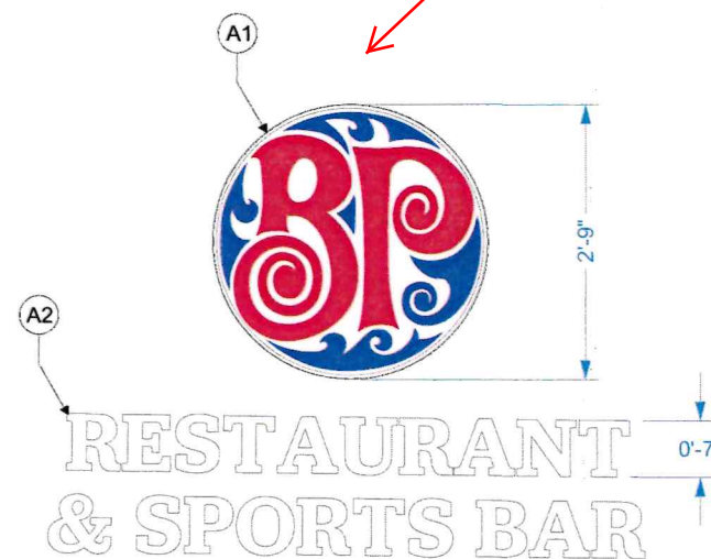
DESIGN VIEW: SCALE: 3/4" = 1'