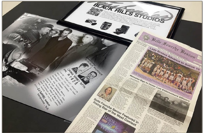
Above: Items on display at newspaper convention in Deadwood. Photos from the collection were published in the Belle Fourche Beacon related to a dedication to law enforcement officers slain in 1946.