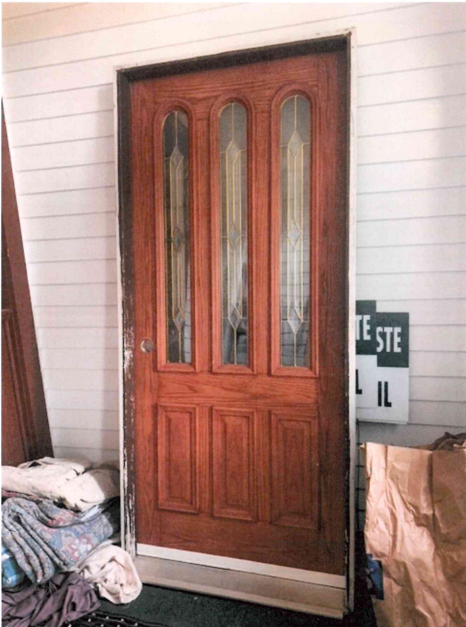
Sent from my iPhone