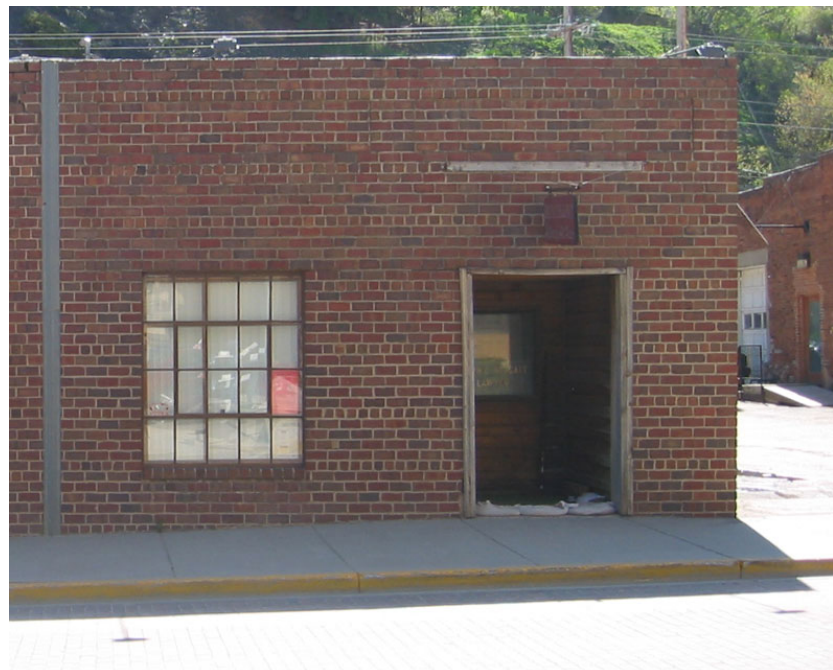
61 SHERMAN - EXISTING ELEVATION