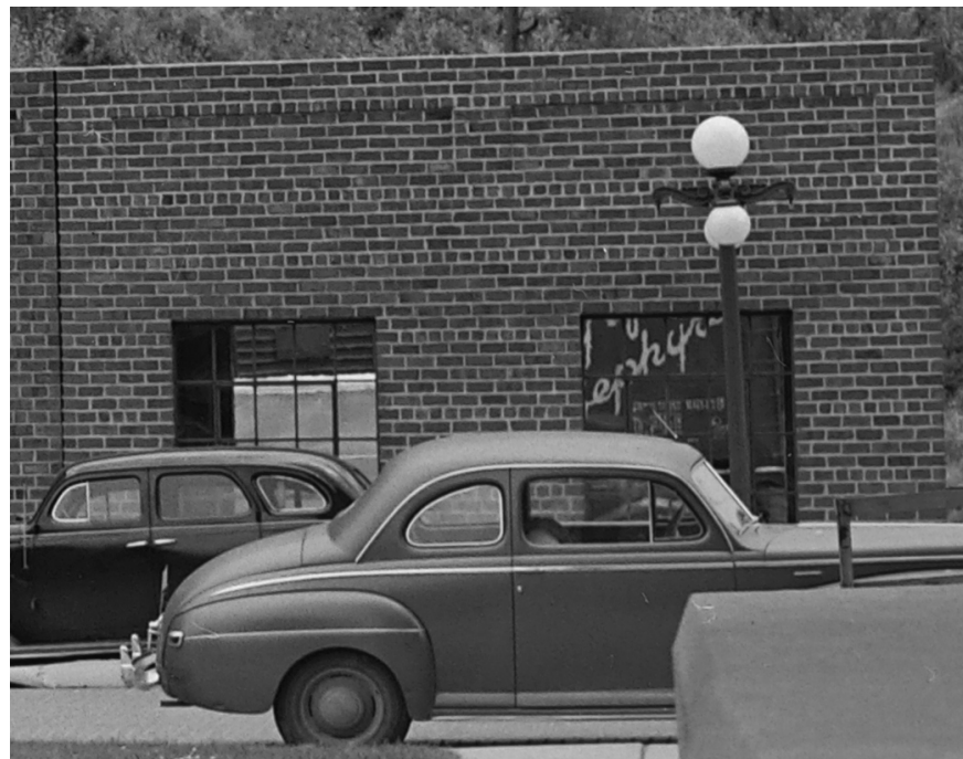
61 SHERMAN - HISTORICAL ELEVATION