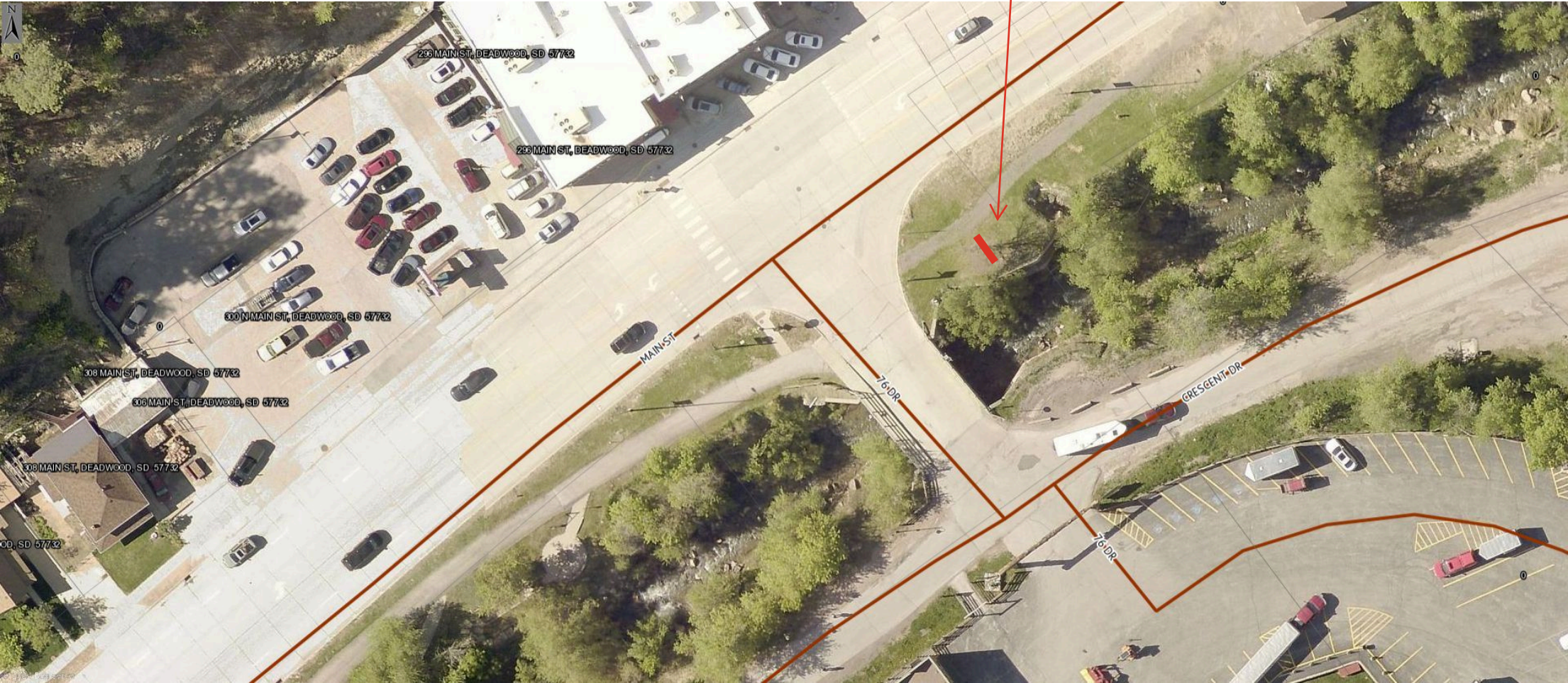
Approximate Location of Sign