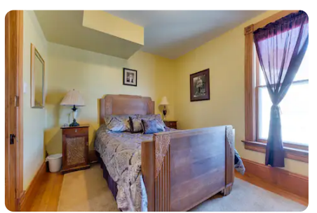
Bedroom 1 1 double bed