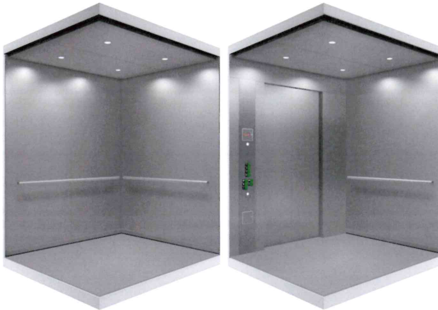
Rear and Side walls